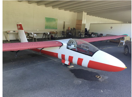
Pilatus B4 Wing Covers