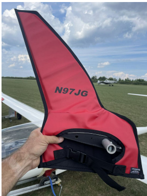
Schempp-Hirth Ventus-2B winglet/wingtip pads

Designed to prevent damage to the wingtip in crowded hangars or high traffic areas, these products are made of bright red Naugahyde and thickly padded with a sandwich of closed cell foam. Protects delicate winglets, casters and their housings, and soft finishes.