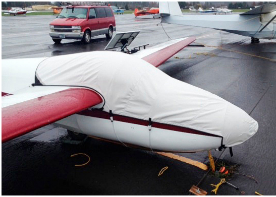
SGS 1-26B Canopy/Nose Cover