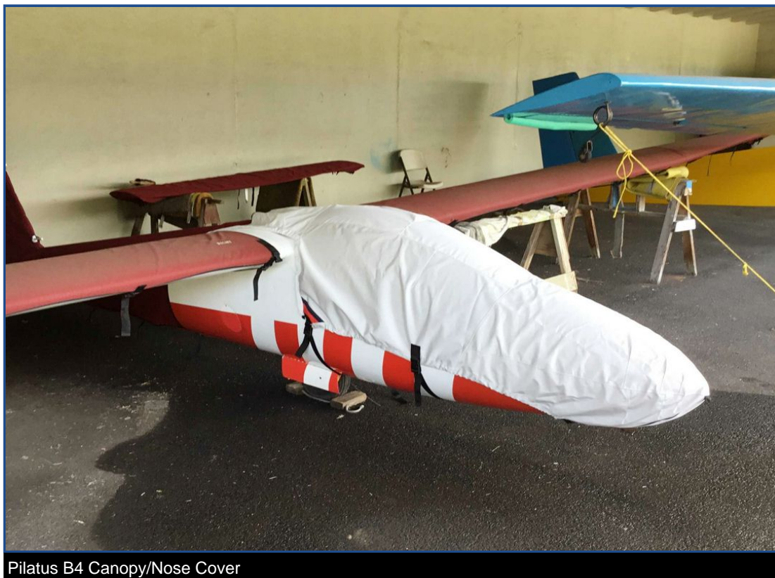
Pilatus B4 Canopy/Nose Cover