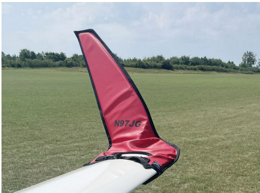
Schempp-Hirth Ventus-2B winglet/wingtip pads