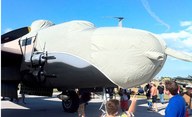
B26 Cockpit/Nose and Gun Turret Covers

This cover type is made from Silver Acrylic Sunbrella canvas and is 100% lined with a soft and smooth microfiber. Bruce's Custom Covers developed this material combination especially for aircraft protection. The outer material is medium weight and treated for water resistance, UV resistance and anti-static buildup. The inner lining is a very soft and smooth microfiber to prevent scratching. The material is very reflective, and tests show that the cabin interior temperature can be reduced to near-ambient temperature on the hottest of days. It is water, ice and snow repellent, yet breathable to allow moisture to escape from between the cover and the aircraft surface.