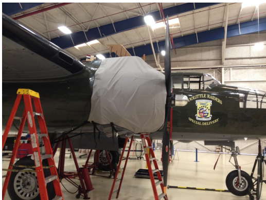
B25 Engine Cover

Engine Covers will cinch around or behind the spinner, cover the entire engine cowl area including the engine air cooling and induction air inlets, and fastens together with Velcro beneath the spinner down the front of the cowling. The Engine Cover is attached with a belly strap aft of the firewall, and can Velcro to the Canopy Cover. Engine Covers are normally made from Solution-Dyed Polyester or Acrylic Sunbrella . An Insulated version of the engine cover can be made with a thicker, quilted, and water-repellent material. The Insulated Engine Cover works well in cold climates to help with engine preheating.