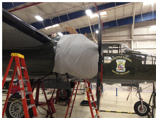
B25 Engine Cover