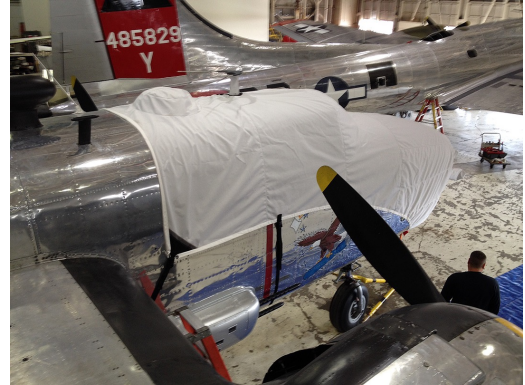
B26 Cockpit/Nose Cover