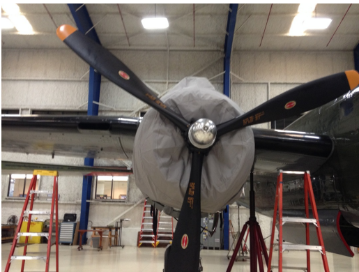
B25 Engine Cover