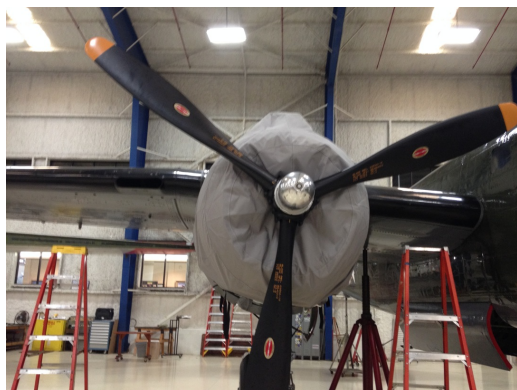
B25 Engine Cover

Engine Covers will cinch around or behind the spinner, cover the entire engine cowl area including the engine air cooling and induction air inlets, and fastens together with Velcro beneath the spinner down the front of the cowling. The Engine Cover is attached with a belly strap aft of the firewall, and can Velcro to the Canopy Cover. Engine Covers are normally made from Solution-Dyed Polyester or Acrylic Sunbrella . An Insulated version of the engine cover can be made with a thicker, quilted, and water-repellent material. The Insulated Engine Cover works well in cold climates to help with engine preheating.