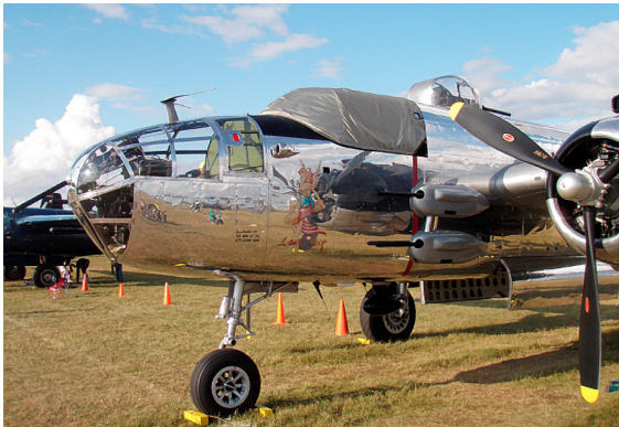
Mitchell B25 Cockpit Cover (Snap-On Type)