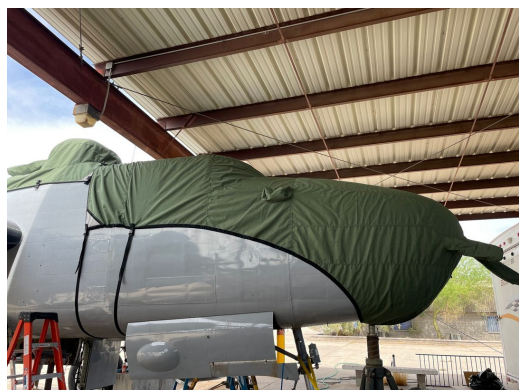
Mitchell B25 Cockpit/Nose Cover, & Turret Cover