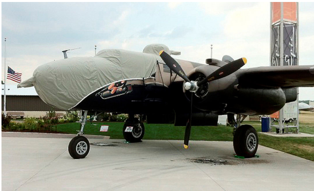
B25 Cockpit/Nose and Gun Turret Covers