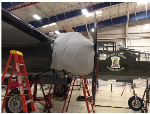
B25 Engine Cover