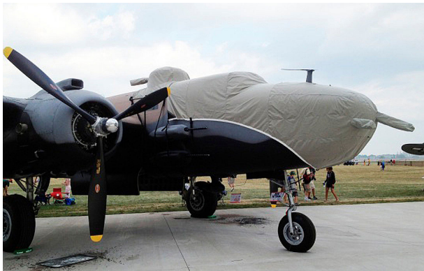
B25 Cockpit/Nose and Gun Turret Covers