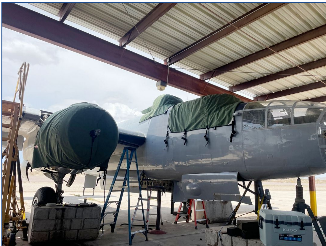
Mitchell B25 Cockpit, Turret &amp; Engine Covers