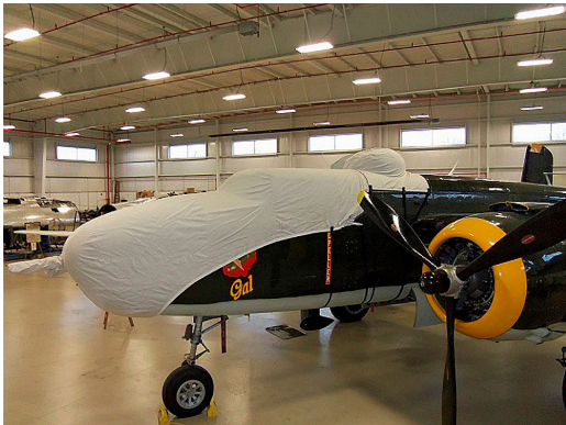
B25 Cockpit/Nose and Gun Turret Covers

This cover type is made from Silver Acrylic Sunbrella canvas and is 100% lined with a soft and smooth microfiber. Bruce's Custom Covers developed this material combination especially for aircraft protection. The outer material is medium weight and treated for water resistance, UV resistance and anti-static buildup. The inner lining is a very soft and smooth microfiber to prevent scratching. The material is very reflective, and tests show that the cabin interior temperature can be reduced to near-ambient temperature on the hottest of days. It is water, ice and snow repellent, yet breathable to allow moisture to escape from between the cover and the aircraft surface.