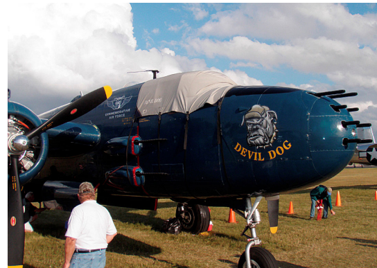
Mitchell B25 Cockpit Cover w/ Custom Imprint (Bellystrap Type)