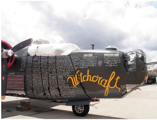
Cockpit/Gun Turret Cover