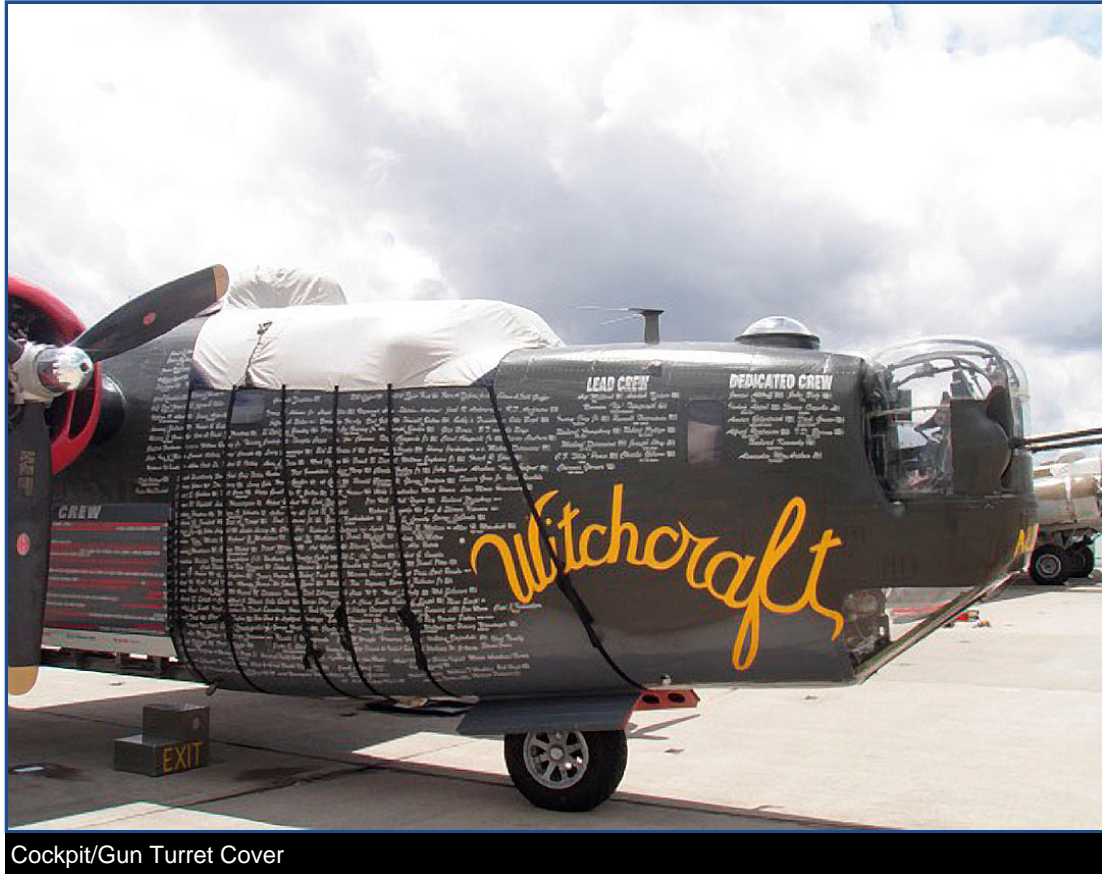
Cockpit/Gun Turret Cover