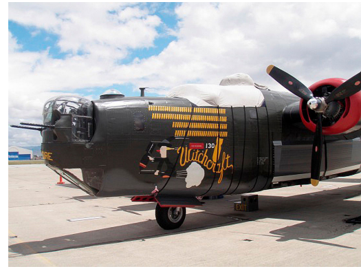
Cockpit/Gun Turret Cover