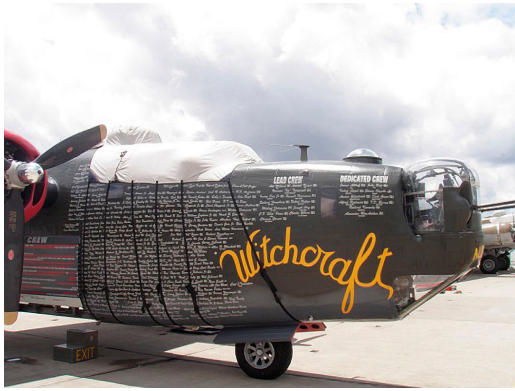
Cockpit/Gun Turret Cover