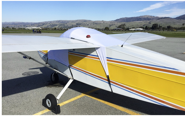
Bolkow Junior 208 Canopy Cover (test fit)