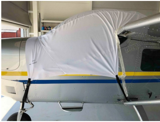
Saab Safari Canopy Cover, test fit cover