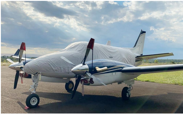
King Air C90GTi Canopy/Nose Cover