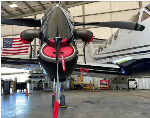
King Air 200 Prop Tie/Exhaust Covers & Engine Plugs

Engine Inlet Plugs are custom fit for your Beech King Air 200, 250, 260 (C-12, RC-12, UC-12) intakes, made with heavy-duty vinyl material, and stuffed with a single block of sculpted urethane foam. Each plug has a zipper that allows the foam to be removed and dried if necessary. Engine plugs have warning flags that are visible from the cockpit or 'remove before flight' streamers sewn onto the face of the plugs. Most plugs are imprinted with the aircraft registration number in black for an extra charge. Storage bag NOT included. Engine plugs may be inserted after flight when the engine is still warm. Engine Inlet Plugs are commonly referred to as Cowl Plugs, Intake Plugs, Cowl Blocks, Engine Blocks, and Engine Bunges.