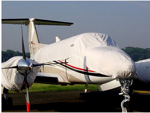
King Air 350 Canopy/Nose Cover, Engine Covers

Travel Covers are made with Silver Solution-Dyed Polyester fabric and only lined over the windshield to save weight. The material is lightweight and more compact for easy stowage in the aircraft. The polyester material is water resistant, but only intended for occasional use outside. We also have an ultra lightweight material available for fitted hangar dust covers. For daily outdoor use, the non-travel Sunbrella Cover is the best choice.