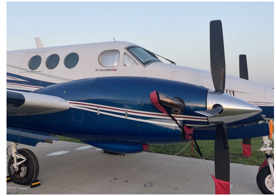
Beech King Air C90 Cockpit HeatShields