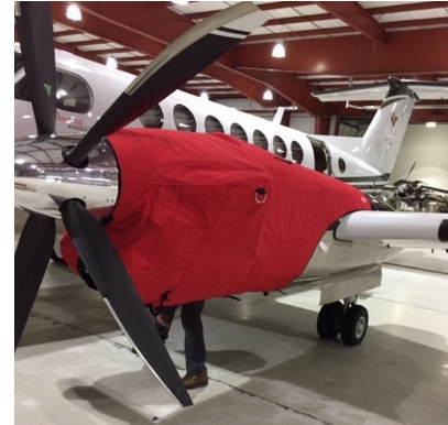
Beech King Air 200 Insulated Engine Cover