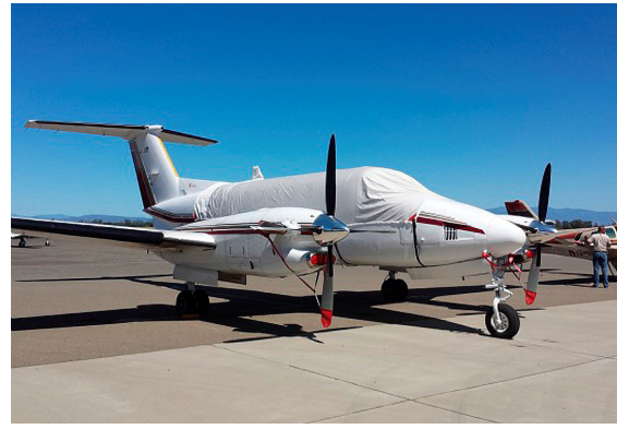
King Air 300 Canopy Cover, Engine Plugs, Prop Tie/Exhaust Covers