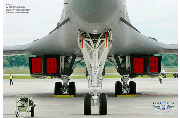
B1-B Bomber Intake Plugs