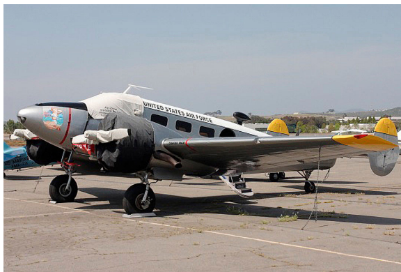
Twin Beech 18 Cockpit, Engine & Prop Covers