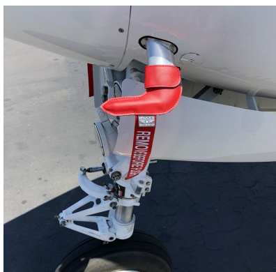
Beech King Air Pitot Covers