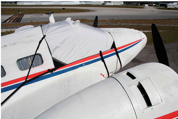
Beech 18 Cockpit Cover

Travel Covers are made with Silver Solution-Dyed Polyester fabric and only lined over the windshield to save weight. The material is lightweight and more compact for easy stowage in the aircraft. The polyester material is water resistant, but only intended for occasional use outside. We also have an ultra lightweight material available for fitted hangar dust covers. For daily outdoor use, the non-travel Sunbrella Cover is the best choice.