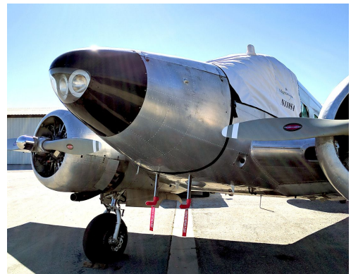
Beech Super 18 Cockpit Cover