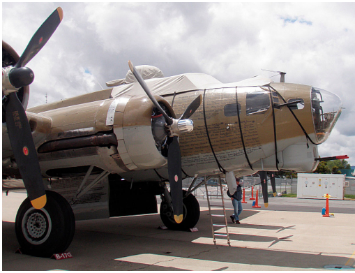
B-17 Canopy/Gun Turret Cover