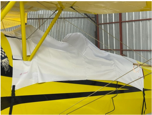
Bucker Jungmann BU-131 Canopy Cover, test fit cover