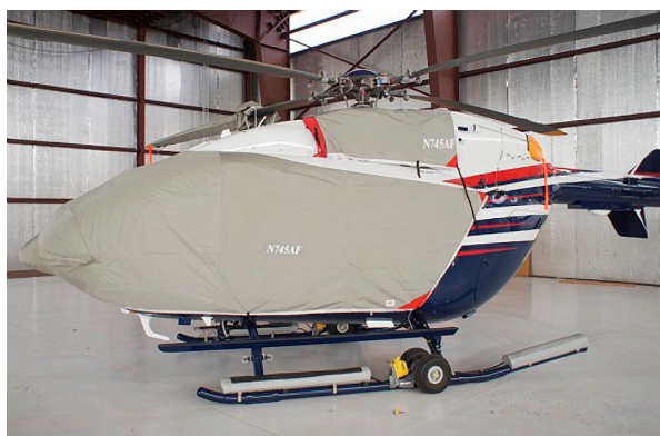
Bubble Cover w/ nose mounted radome, Upper Deck Plugs/Cover

This cover type is made from Silver Acrylic Sunbrella canvas and is 100% lined with a soft and smooth microfiber. Bruce's Custom Covers developed this material combination especially for aircraft protection. The outer material is medium weight and treated for water resistance, UV resistance and anti-static buildup. The inner lining is a very soft and smooth microfiber to prevent scratching. The material is very reflective, and tests show that the cabin interior temperature can be reduced to near-ambient temperature on the hottest of days. It is water, ice and snow repellent, yet breathable to allow moisture to escape from between the cover and the aircraft surface.