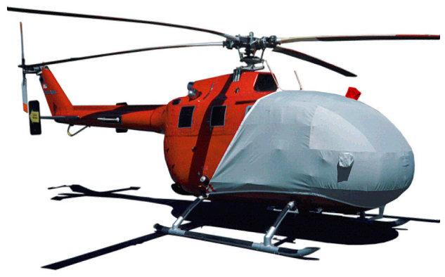
MBB BO-105 Bubble Cover