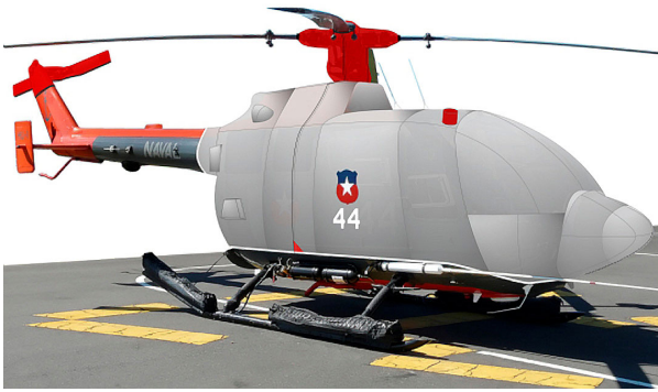
MBB BO-105 Full Body, Rotor Mast & Tail Rotor Covers (illustration)