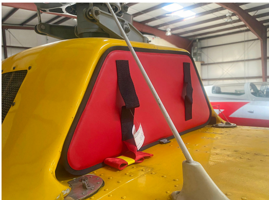
BO 105CB Intake Plug