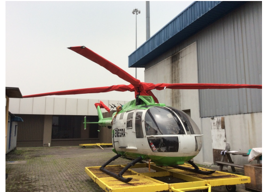
MBB BO-105 Blade, Rotor Head & Tail Rotor Covers