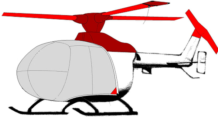
MBB BO-105 Covers (illustration)

WINTER USE MATERIAL - Made with Solution-Dyed Polyester fabric, this option is intended for seasonal use to aid in deicing, rain mitigation, or for occasional travel. The material is lighter and more compact, but more susceptible to UV damage and may have a shorter useful life if used continuously outside than the all-year use material.