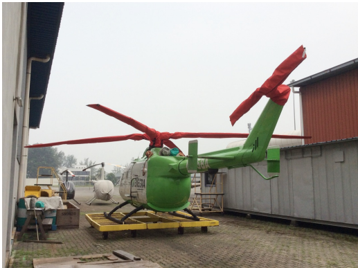
MBB BO-105 Blade, Rotor Head & Tail Rotor Covers

WINTER USE MATERIAL - Made with Solution-Dyed Polyester fabric, this option is intended for seasonal use to aid in deicing, rain mitigation, or for occasional travel. The material is lighter and more compact, but more susceptible to UV damage and may have a shorter useful life if used continuously outside than the all-year use material.