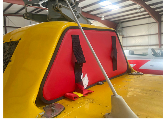
BO 105CB Intake Plug