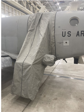
King Air Airstair Coor Cover

WINTER USE MATERIAL - Made with Solution-Dyed Polyester fabric, this option is intended for seasonal use to aid in deicing, rain mitigation, or for occasional travel. The material is lighter and more compact, but more susceptible to UV damage and may have a shorter useful life if used continuously outside than the all-year use material.