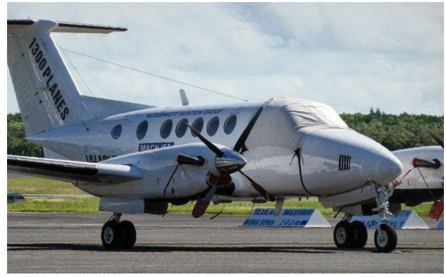
King Air 200