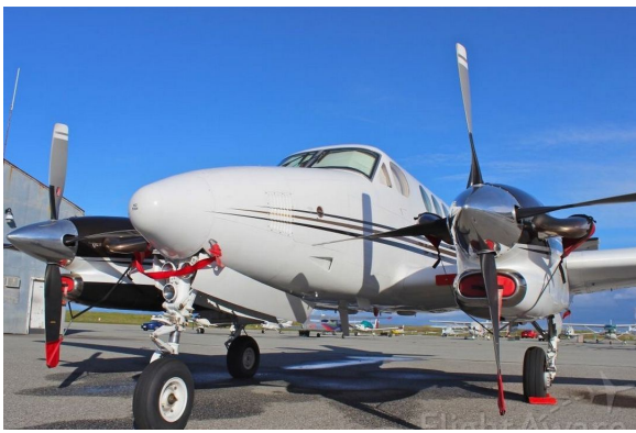
King Air C90A Engine Plugs and Pitot Covers