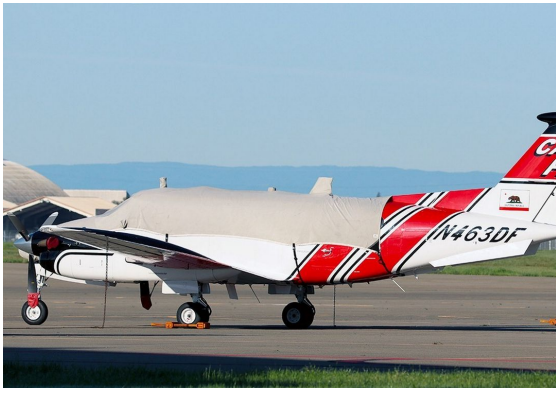
Beech King Air B200 Canopy/Nose Cover