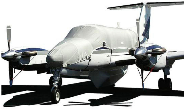
King Air Canopy/Nose Cover