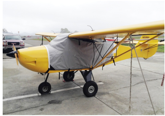
Avid Flyer Extended Canopy Cover