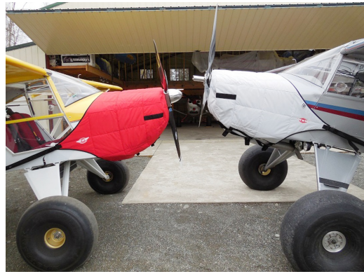
Avid Insulated Engine Covers