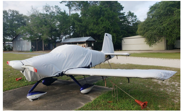
Van's RV-7A Cover Set