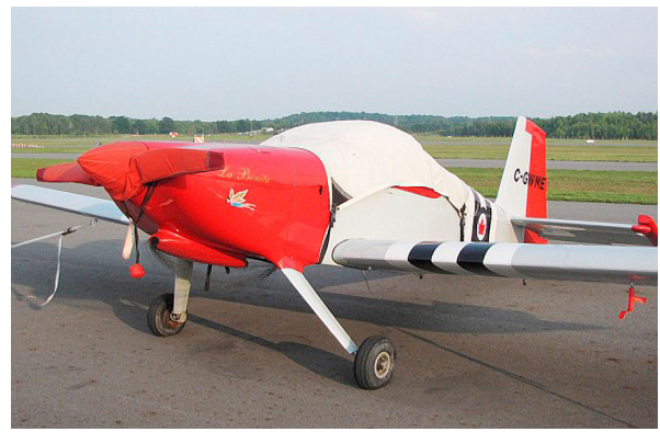
Van's RV-6 2-Blade Prop Cover