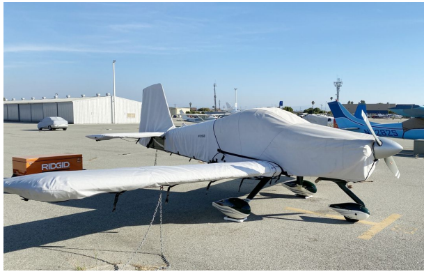
Van's RV-9A Extended Canopy/Engine, Wing & Empennage Covers