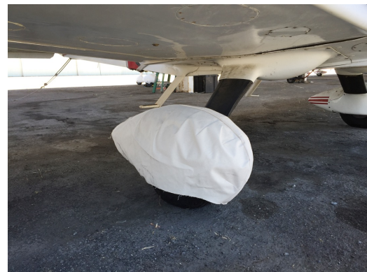
Grumman AA5 Main Wheelpant Cover, test fit