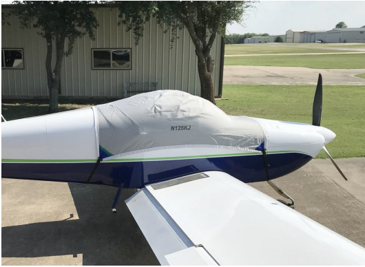
Van's RV-9A Travel Weight Canopy Cover

Travel Covers are made with Silver Solution-Dyed Polyester fabric and only lined over the windshield to save weight. The material is lightweight and more compact for easy stowage in the aircraft. The polyester material is water resistant, but only intended for occasional use outside. We also have an ultra lightweight material available for fitted hangar dust covers. For daily outdoor use, the non-travel Sunbrella Cover is the best choice.