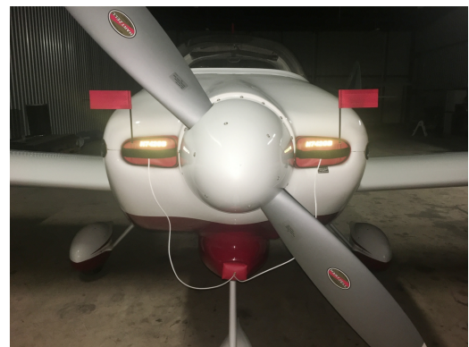
Van's Aircraft RV-7A Engine Inlet Plugs