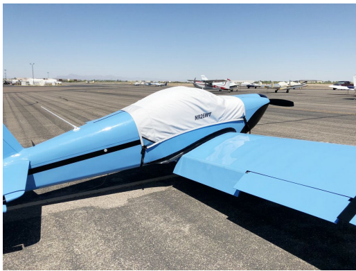
Van's RV-6 Canopy Cover

This cover type is made from Silver Acrylic Sunbrella canvas and is 100% lined with a soft and smooth microfiber. Bruce's Custom Covers developed this material combination especially for aircraft protection. The outer material is medium weight and treated for water resistance, UV resistance and anti-static buildup. The inner lining is a very soft and smooth microfiber to prevent scratching. The material is very reflective, and tests show that the cabin interior temperature can be reduced to near-ambient temperature on the hottest of days. It is water, ice and snow repellent, yet breathable to allow moisture to escape from between the cover and the aircraft surface.