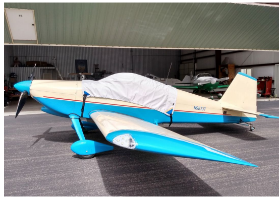
Van's RV-6 Canopy Cover