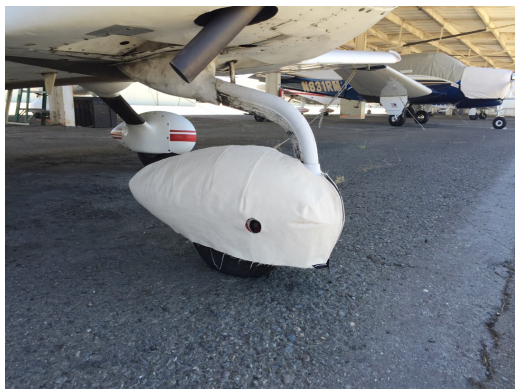
Grumman AA5 Nose Wheelpant Cover, test fit

ALL-YEAR USE MATERIAL - Made with Silver Acrylic Sunbrella canvas, the all-year use material is the best option for sun protection and cover longevity. This heavier more durable material is intended for all weather conditions, such as rain and snow or lots of sun.