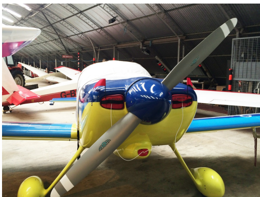
Van's RV-6 Engine Inlet Plugs

Engine Inlet Plugs are custom fit for your Aura Aero Integral R intakes, made with heavy-duty vinyl material, and stuffed with a single block of sculpted urethane foam. Each plug has a zipper that allows the foam to be removed and dried if necessary. Engine plugs have warning flags that are visible from the cockpit or 'remove before flight' streamers sewn onto the face of the plugs. Most plugs are imprinted with the aircraft registration number in black for an extra charge. Storage bag NOT included. Engine plugs may be inserted after flight when the engine is still warm. Engine Inlet Plugs are commonly referred to as Cowl Plugs, Intake Plugs, Cowl Blocks, Engine Blocks, and Engine Bungs.