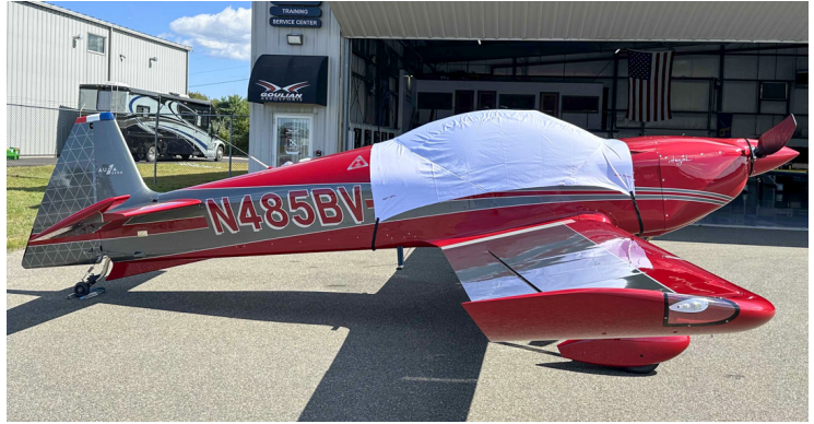
Aura Aero Integral R Canopy Cover, test fit cover