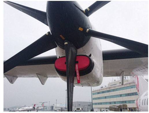
ATR-42/72 Engine Inlet Plugs