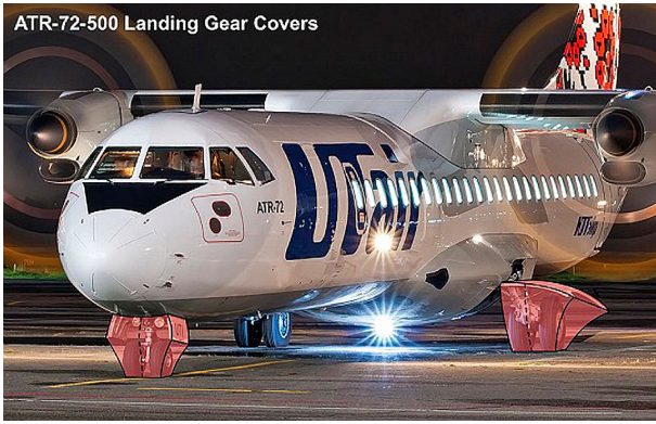
ATR 72 Landing Gear/Tire Covers