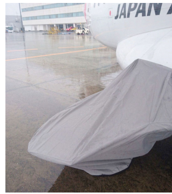
ATR-42/72 Main Gear Landing Gear/Tire Covers