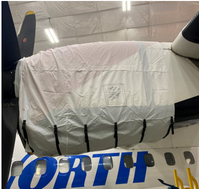
ATR-42-300 Insulated Engine Cover, test fit cover