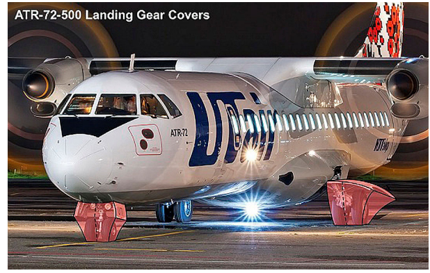
ATR 72 Landing Gear/Tire Covers