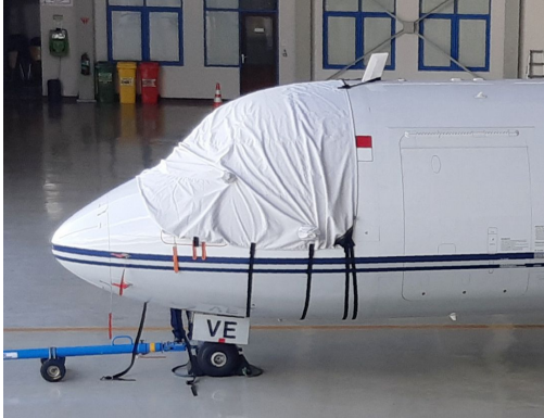
ATR-42 Cockpit Cover

This cover type is made from Silver Acrylic Sunbrella canvas and is 100% lined with a soft and smooth microfiber. Bruce's Custom Covers developed this material combination especially for aircraft protection. The outer material is medium weight and treated for water resistance, UV resistance and anti-static buildup. The inner lining is a very soft and smooth microfiber to prevent scratching. The material is very reflective, and tests show that the cabin interior temperature can be reduced to near-ambient temperature on the hottest of days. It is water, ice and snow repellent, yet breathable to allow moisture to escape from between the cover and the aircraft surface.