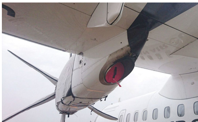
ATR-42/72 Exhaust Plugs