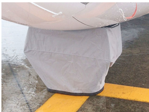
ATR-42/72 Nose Gear Landing Gear/Tire Covers