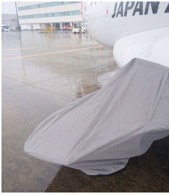
ATR-42/72 Main Gear Landing Gear/Tire Covers