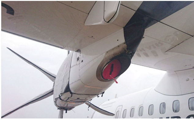
ATR-42/72 Exhaust Plugs