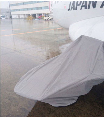
ATR-42/72 Main Gear Landing Gear/Tire Covers