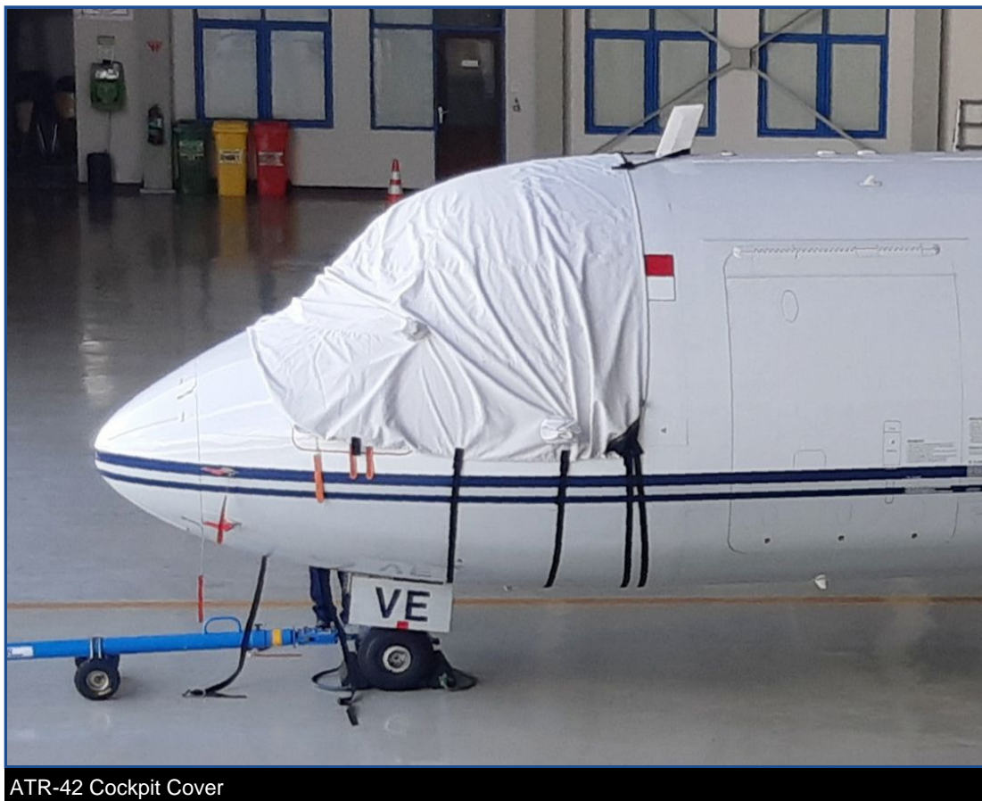
ATR-42 Cockpit Cover