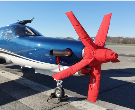
Socata TBM Insulated 5-Blade Prop/Spinner Cover

water resistance, UV resistance and anti-static buildup. The inner lining is a very soft and smooth microfiber to prevent scratching. The material is very reflective, and tests show that the cabin interior temperature can be reduced to near-ambient temperature on the hottest of days. It is water, ice and snow repellent, yet breathable to allow moisture to escape from between the cover and the aircraft surface.