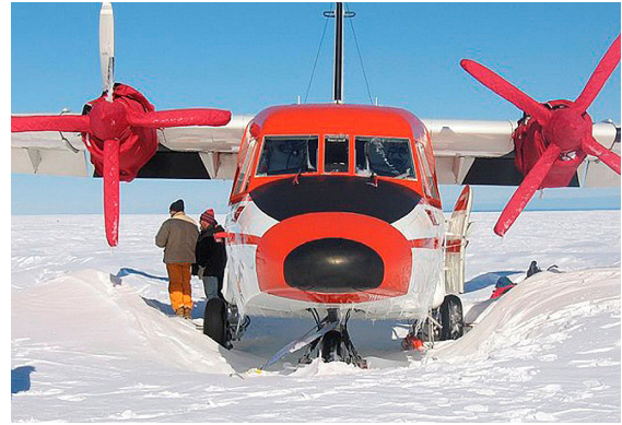
Casa 212 Insulated Engine & Propeller/Spinner Covers