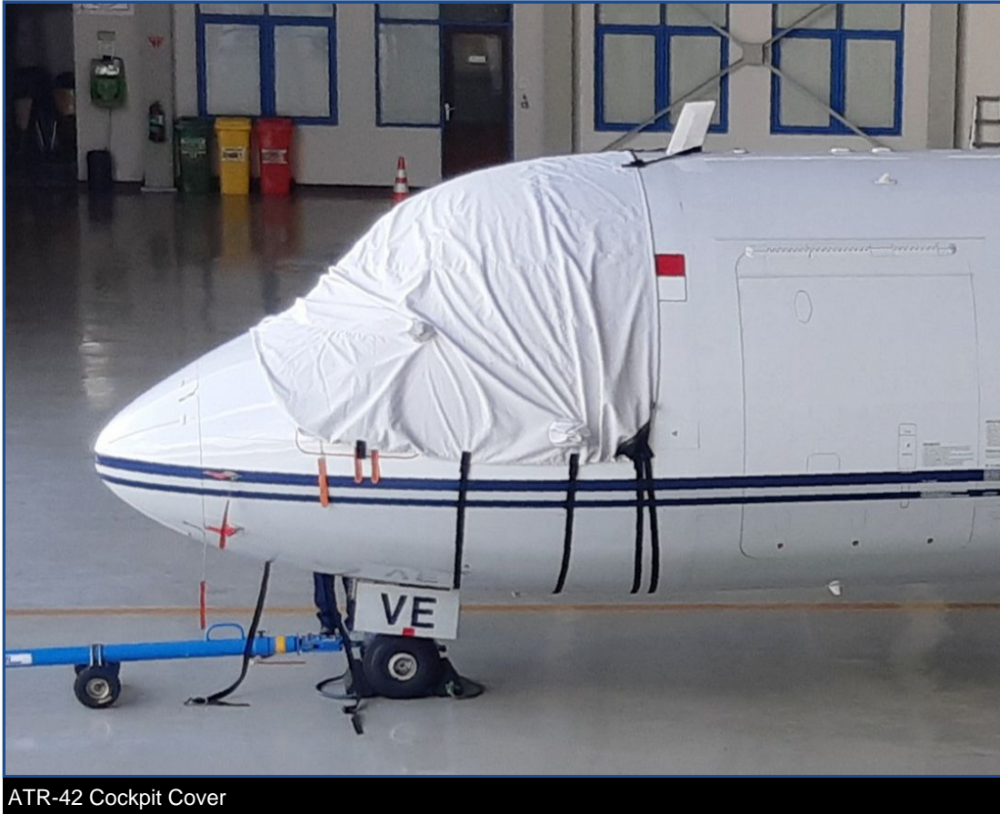
ATR-42 Cockpit Cover