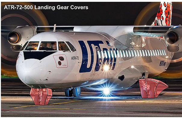
ATR 72 Landing Gear/Tire Covers