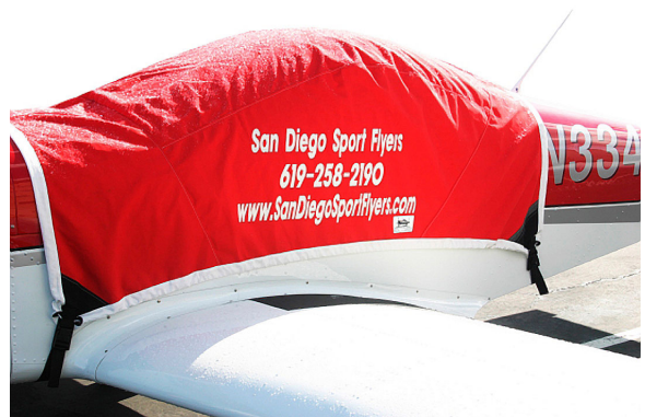
Gobosh Canopy Cover with custom Imprint