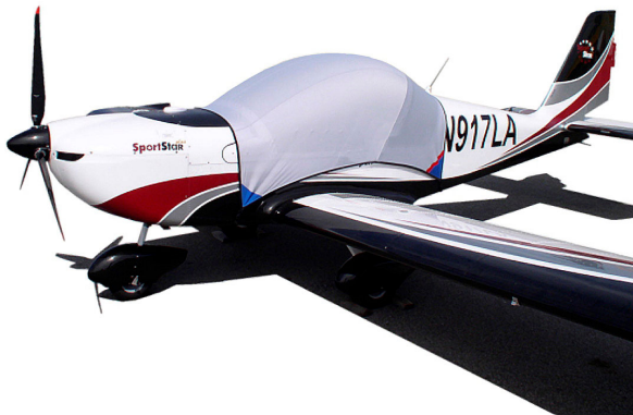
Evektor Sportstar Light Weight Travel-Cover

This cover type is made from Silver Acrylic Sunbrella canvas and is 100% lined with a soft and smooth microfiber. Bruce's Custom Covers developed this material combination especially for aircraft protection. The outer material is medium weight and treated for water resistance, UV resistance and anti-static buildup. The inner lining is a very soft and smooth microfiber to prevent scratching. The material is very reflective, and tests show that the cabin interior temperature can be reduced to near-ambient temperature on the hottest of days. It is water, ice and snow repellent, yet breathable to allow moisture to escape from between the cover and the aircraft surface.