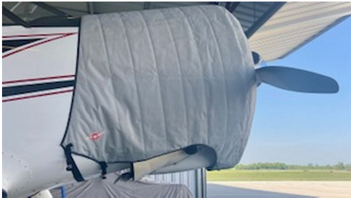
Stinson Reliant V-77, SR, AT-19 Insulated Engine Cover