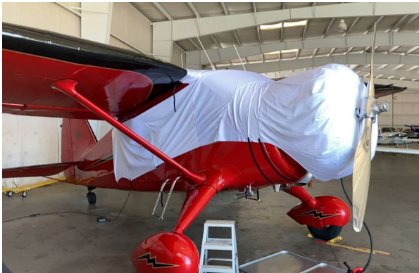
Stinson Reliant Over-Top Canopy/Engine Cover