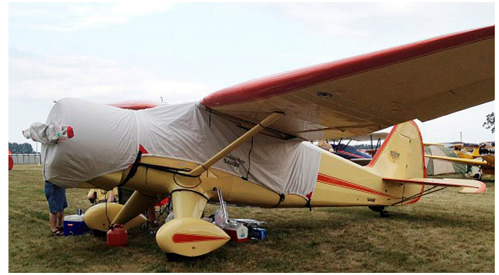
Stinson Reliant Over-the-top Canopy, Engine, and Propeller Cover