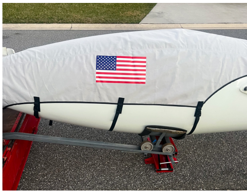
Schleicher ASW-20 Canopy/Nose Cover, ASW-20/20C