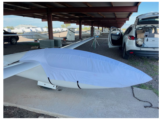
Schleicher ASW-19 Canopy/Nose Cover, test fit cover