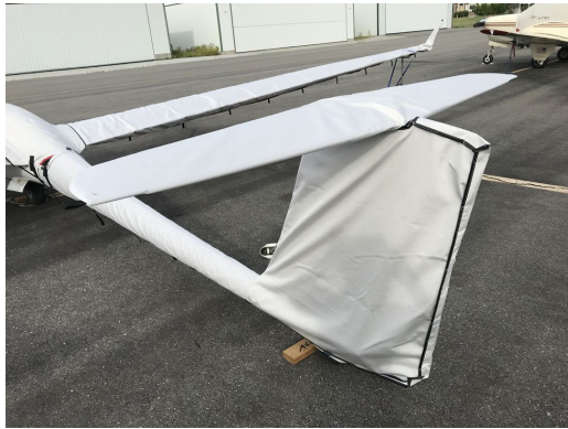
Schleicher ASW-27b Empennage & Wing Covers

WINTER USE MATERIAL - Made with Solution-Dyed Polyester fabric, this option is intended for seasonal use to aid in deicing, rain mitigation, or for occasional travel. The material is lighter and more compact, but more susceptible to UV damage and may have a shorter useful life if used continuously outside than the all-year use material.