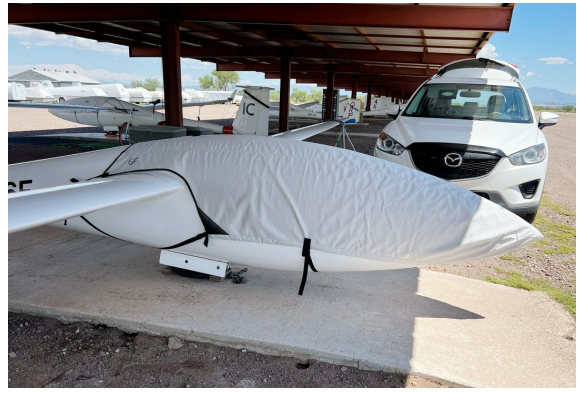
Schleicher ASW-19 Canopy/Nose Cover