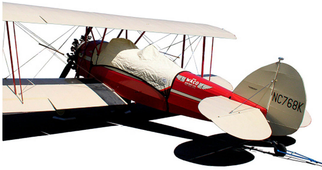
Waco 10 Canopy Cover