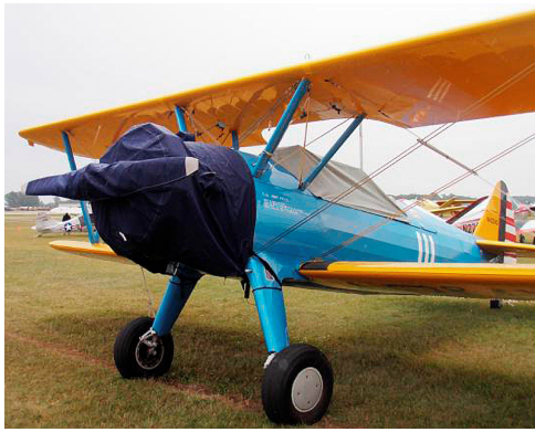
Stearman PT-13 Engine Cover