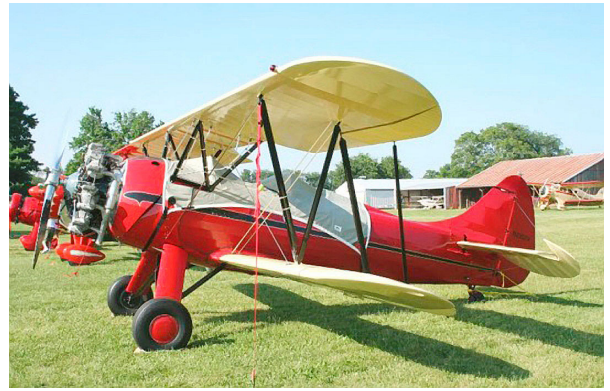
Waco YMF Canopy Cover