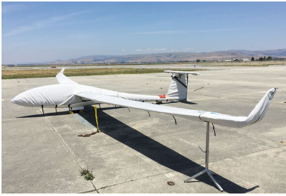
Schmepp-Hirth Discus 2B Full Cover Set