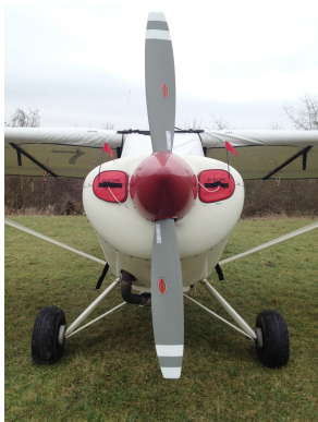
Aviat Husky Engine Plugs, Wing Covers

Engine Inlet Plugs are custom fit for your Normand Dube Aerocruiser intakes, made with heavy-duty vinyl material, and stuffed with a single block of sculpted urethane foam. Each plug has a zipper that allows the foam to be removed and dried if necessary. Engine plugs have warning flags that are visible from the cockpit or 'remove before flight' streamers sewn onto the face of the plugs. Most plugs are imprinted with the aircraft registration number in black for an extra charge. Storage bag NOT included. Engine plugs may be inserted after flight when the engine is still warm. Engine Inlet Plugs are commonly referred to as Cowl Plugs, Intake Plugs, Cowl Blocks, Engine Blocks, and Engine Bungs.