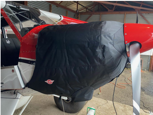
Aviat Husky insulated engine cover

This cover type is made from Silver Acrylic Sunbrella canvas and is 100% lined with a soft and smooth microfiber. Bruce's Custom Covers developed this material combination especially for aircraft protection. The outer material is medium weight and treated for water resistance, UV resistance and anti-static buildup. The inner lining is a very soft and smooth microfiber to prevent scratching. The material is very reflective, and tests show that the cabin interior temperature can be reduced to near-ambient temperature on the hottest of days. It is water, ice and snow repellent, yet breathable to allow moisture to escape from between the cover and the aircraft surface.