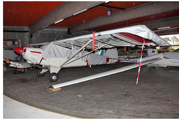
Aviat Husky Engine Plugs, Canopy, Wing & Empennage Covers