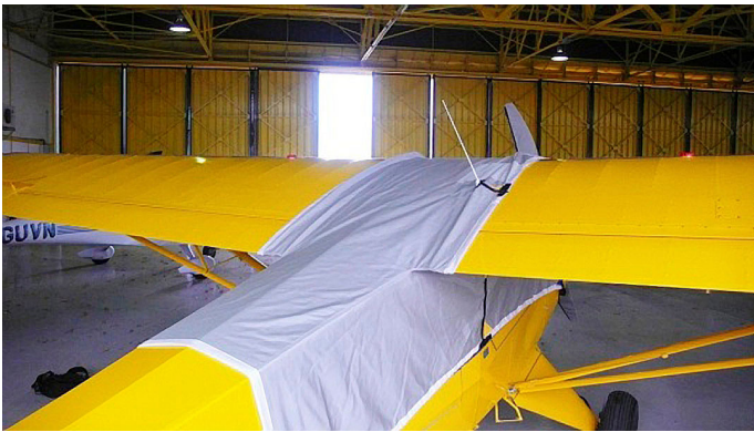
Aviat Husky Canopy Cover

This cover type is made from Silver Acrylic Sunbrella canvas and is 100% lined with a soft and smooth microfiber. Bruce's Custom Covers developed this material combination especially for aircraft protection. The outer material is medium weight and treated for water resistance, UV resistance and anti-static buildup. The inner lining is a very soft and smooth microfiber to prevent scratching. The material is very reflective, and tests show that the cabin interior temperature can be reduced to near-ambient temperature on the hottest of days. It is water, ice and snow repellent, yet breathable to allow moisture to escape from between the cover and the aircraft surface.