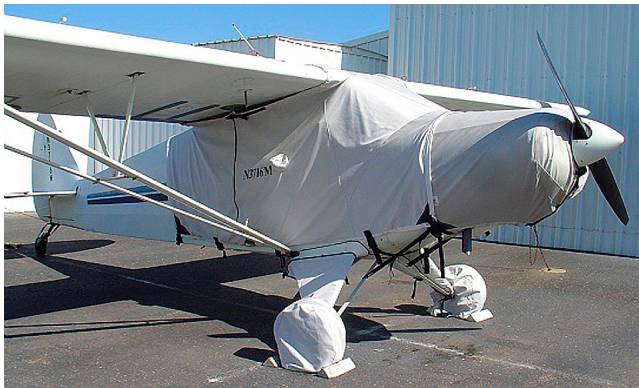
Piper PA-12 Extended Canopy, Engine & Landing Gear Covers

This cover type is made from Silver Acrylic Sunbrella canvas and is 100% lined with a soft and smooth microfiber. Bruce's Custom Covers developed this material combination especially for aircraft protection. The outer material is medium weight and treated for water resistance, UV resistance and anti-static buildup. The inner lining is a very soft and smooth microfiber to prevent scratching. The material is very reflective, and tests show that the cabin interior temperature can be reduced to near-ambient temperature on the hottest of days. It is water, ice and snow repellent, yet breathable to allow moisture to escape from between the cover and the aircraft surface.