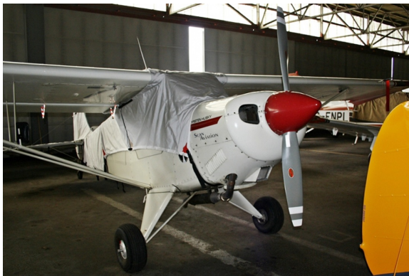
Aviat Husky Canopy Cover, Empennage Cover