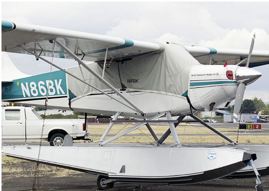
Aviat Husky Canopy Cover and Inlet Plugs