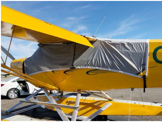
Sportsman 2+2 Wag Aero Light Weight Over the Top Travel Canopy Cover