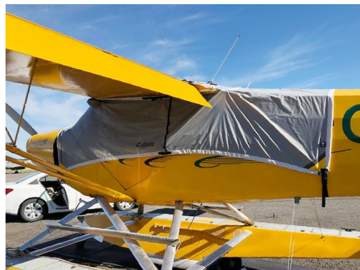
Sportsman 2+2 Wag Aero Light Weight Over the Top Travel Canopy Cover