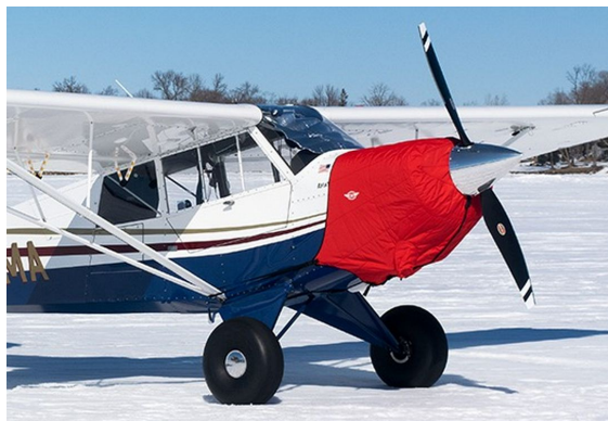
Aviat (Christen) Husky Insulated Engine Cover

This cover type is made from Silver Acrylic Sunbrella canvas and is 100% lined with a soft and smooth microfiber. Bruce's Custom Covers developed this material combination especially for aircraft protection. The outer material is medium weight and treated for water resistance, UV resistance and anti-static buildup. The inner lining is a very soft and smooth microfiber to prevent scratching. The material is very reflective, and tests show that the cabin interior temperature can be reduced to near-ambient temperature on the hottest of days. It is water, ice and snow repellent, yet breathable to allow moisture to escape from between the cover and the aircraft surface.