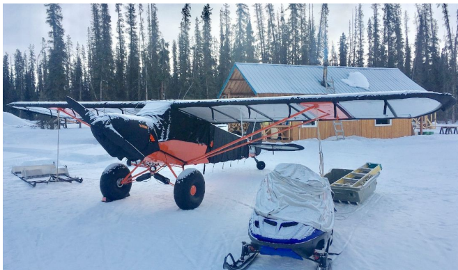
Piper PA-18 Super Cub Canopy Cover (Over-The-Top Style)

WINTER USE MATERIAL - Made with Solution-Dyed Polyester fabric, this option is intended for seasonal use to aid in deicing, rain mitigation, or for occasional travel. The material is lighter and more compact, but more susceptible to UV damage and may have a shorter useful life if used continuously outside than the all-year use material.