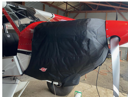
Aviat Husky insulated engine cover