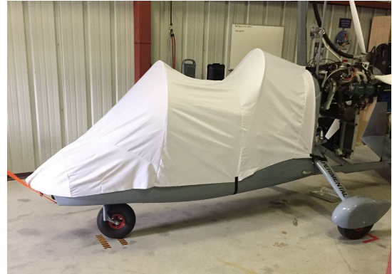
Magni M16 Autogyro Canopy/Nose Cover, test fit cover