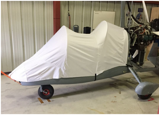
Magni M16 Autogyro Canopy/Nose Cover, test fit cover