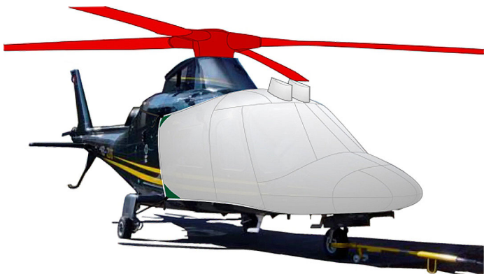
Agusta 109 Bubble, Rotor Hub & Blade Covers (illustration)

WINTER USE MATERIAL - Made with Solution-Dyed Polyester fabric, this option is intended for seasonal use to aid in deicing, rain mitigation, or for occasional travel. The material is lighter and more compact, but more susceptible to UV damage and may have a shorter useful life if used continuously outside than the all-year use material.