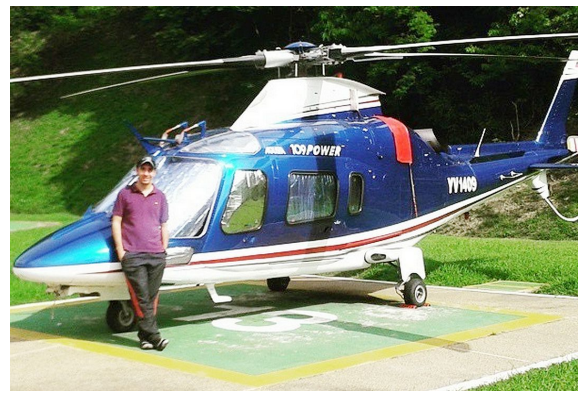
Agusta Power Cockpit & Cabin HeatShields