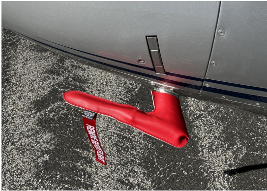
Agusta AW109 (A, C, & Trekker) Pitot Cover Set

aircraft registration number in black for an extra charge. Storage bag NOT included. Engine plugs may be inserted after flight when the engine is still warm. Engine Inlet Plugs are commonly referred to as Cowl Plugs, Intake Plugs, Cowl Blocks, Engine Blocks, and Engine Bungs.