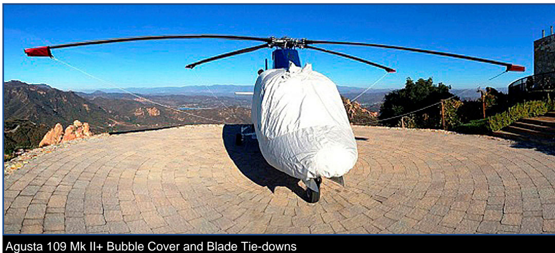
Agusta 109 Mk II+ Bubble Cover and Blade Tie-downs