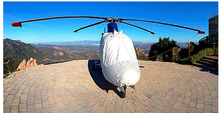
Agusta 109 Mk II+ Bubble Cover and Blade Tie-downs