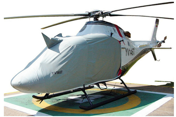
Koala Bubble Cover (with Wire Strike)