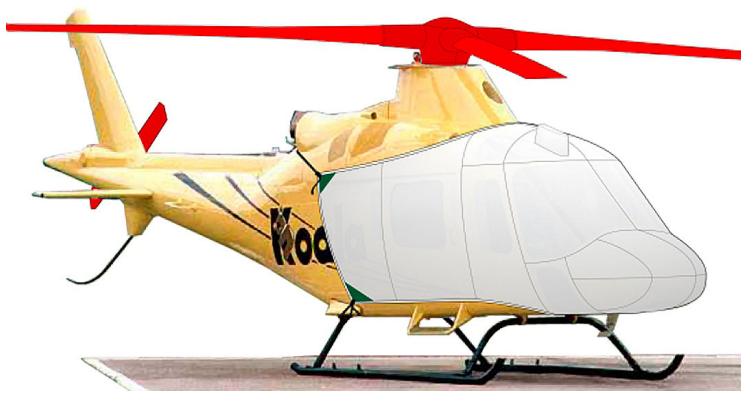
Koala Bubble, Rotor Hub, Blade & Tail Rotor Covers (illustration)