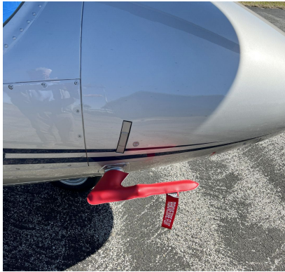
Agusta AW109 (A, C, & Trekker) Pitot Cover Set