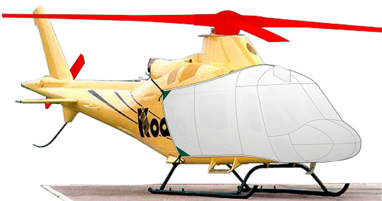
Koala Bubble, Rotor Hub, Blade & Tail Rotor Covers (illustration)