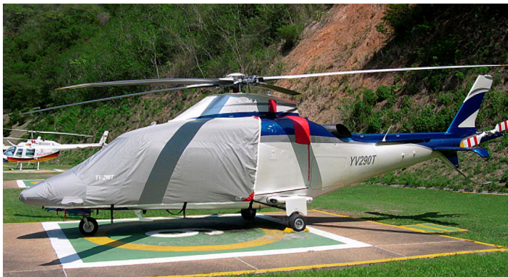
Agusta Grand Bubble Cover

Travel Covers are made with Silver Solution-Dyed Polyester fabric and fully lined over the entire cover. The material is lightweight and more compact for easy storage in the aircraft. The polyester material is water resistant, but only intended for occasional use outside. We also have an ultra lightweight material available for fitted hangar dust covers. For daily outdoor use, the non-travel Sunbrella Cover is the best choice.