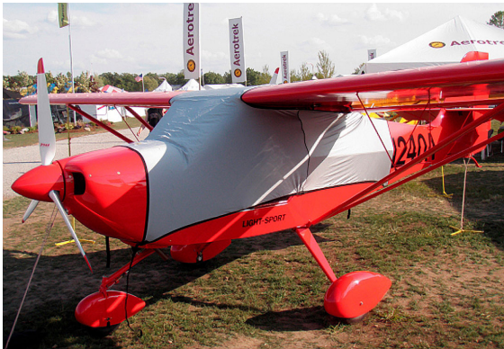
Aerotrek A240 Spandex FlyAway Travel Canopy Cover

This cover type is made from Silver Acrylic Sunbrella canvas and is 100% lined with a soft and smooth microfiber. Bruce's Custom Covers developed this material combination especially for aircraft protection. The outer material is medium weight and treated for water resistance, UV resistance and anti-static buildup. The inner lining is a very soft and smooth microfiber to prevent scratching. The material is very reflective, and tests show that the cabin interior temperature can be reduced to near-ambient temperature on the hottest of days. It is water, ice and snow repellent, yet breathable to allow moisture to escape from between the cover and the aircraft surface.