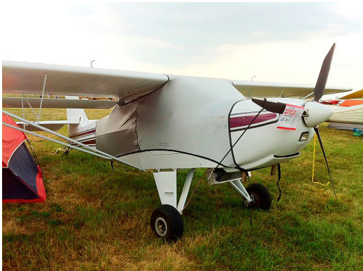
Kitfox Spandex FlyAway Travel Canopy Cover

Travel Covers are made with Silver Solution-Dyed Polyester fabric and only lined over the windshield to save weight. The material is lightweight and more compact for easy stowage in the aircraft. The polyester material is water resistant, but only intended for occasional use outside. We also have an ultra lightweight material available for fitted hangar dust covers. For daily outdoor use, the non-travel Sunbrella Cover is the best choice.