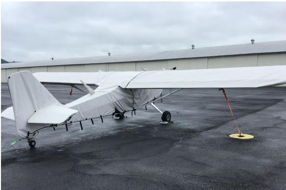
Kitfox 5 Complete Cover Set

shorter useful life if used continuously outside than the all-year use material.