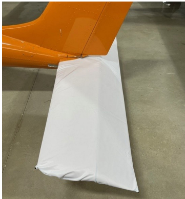
Aeromarine Merlin Horizontal Stabilizer Covers, test fit covers