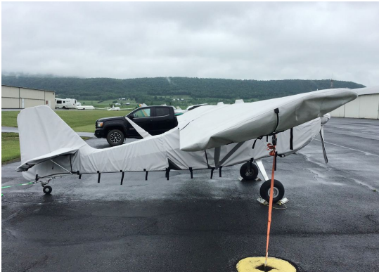
Kitfox 5 Complete Cover Set