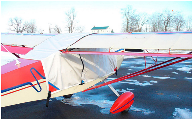
Kitfox IV Over-the-top Canopy Cover