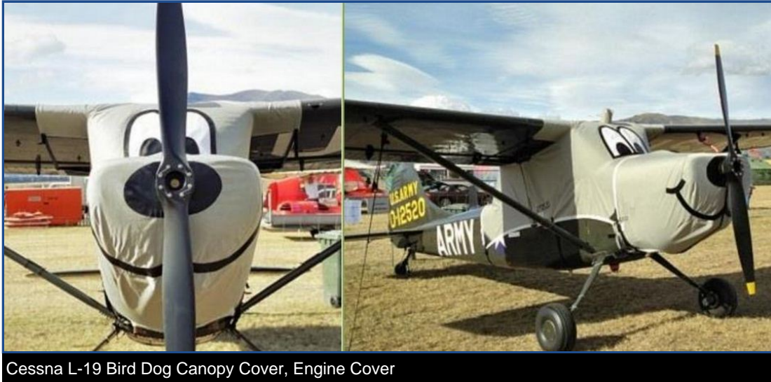
Cessna L-19 Bird Dog Canopy Cover, Engine Cover