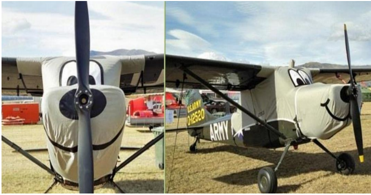
Cessna L-19 Bird Dog Canopy Cover, Engine Cover

the hottest of days. It is water, ice and snow repellent, yet breathable to allow moisture to escape from between the cover and the aircraft surface.