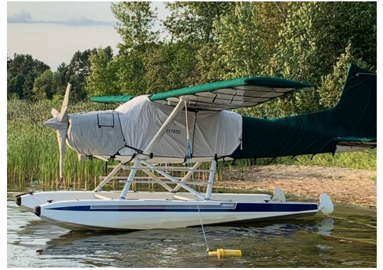
Cessna A185F Complete Cover Set