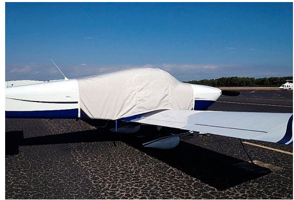
Van's RV-10 Extended Canopy Cover