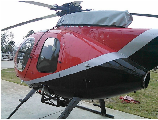
Customized Engine Cover

WINTER USE MATERIAL - Made with Solution-Dyed Polyester fabric, this option is intended for seasonal use to aid in deicing, rain mitigation, or for occasional travel. The material is lighter and more compact, but more susceptible to UV damage and may have a shorter useful life if used continuously outside than the all-year use material.