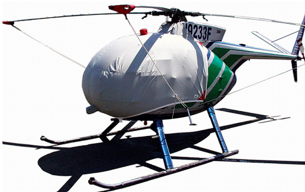
Hughes 500C Bubble Cover with Intake Add-on, Blade Tie-downs

WINTER USE MATERIAL - Made with Solution-Dyed Polyester fabric, this option is intended for seasonal use to aid in deicing, rain mitigation, or for occasional travel. The material is lighter and more compact, but more susceptible to UV damage and may have a shorter useful life if used continuously outside than the all-year use material.