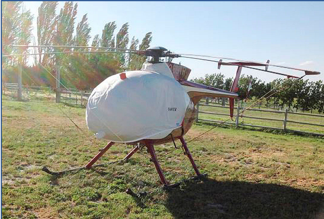
MD500D Bubble Cover with Intake Add-On