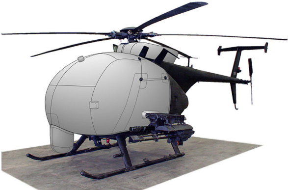
MH-6J Bubble, Flir & Doghouse Covers (illustration)