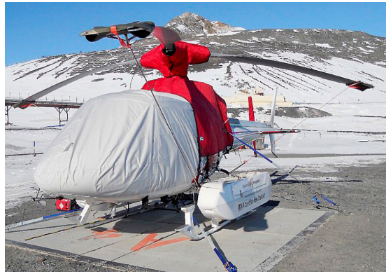
AS350 Bubble Cover w/ Cargo Mirror, Blade Tie-downs, Insulated Engine, Insulated Main Rotor Hub and Insulated Tail Rotor Covers