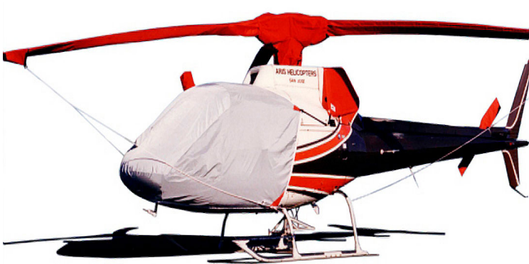
Bubble Cover, Intake/Exhaust, Rotor Mast, Tail Rotor & Main Body Covers

Travel Covers are made with Silver Solution-Dyed Polyester fabric and fully lined over the entire cover. The material is lightweight and more compact for easy stowage in the aircraft. The polyester material is water resistant, but only intended for occasional use outside. We also have an ultra lightweight material available for fitted hangar dust covers. For daily outdoor use, the non-travel Sunbrella Cover is the best choice.