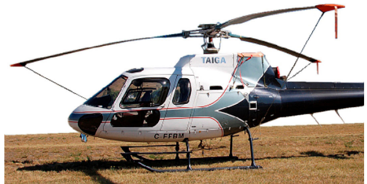
AS350 Blade Tie-Downs