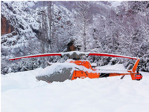
AS350 Bubble Cover, Insulated Main & Tail Rotor Covers, Blade Covers with tid-down detail

WINTER USE MATERIAL - Made with Solution-Dyed Polyester fabric, this option is intended for seasonal use to aid in deicing, rain mitigation, or for occasional travel. The material is lighter and more compact, but more susceptible to UV damage and may have a shorter useful life if used continuously outside than the all-year use material.