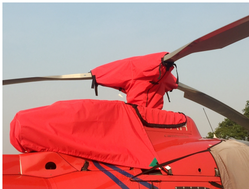
Airbus H-125 & Aerospatiale AS350 Intake/Exhaust Cover, Main Rotor Hub Cover with Weighted Skirt

WINTER USE MATERIAL - Made with Solution-Dyed Polyester fabric, this option is intended for seasonal use to aid in deicing, rain mitigation, or for occasional travel. The material is lighter and more compact, but more susceptible to UV damage and may have a shorter useful life if used continuously outside than the all-year use material.