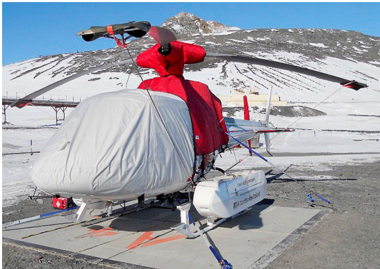
AS350 Bubble Cover w/ Cargo Mirror, Blade Tie-downs, Insulated Engine, Insulated Main Rotor Hub and Insulated Tail Rotor Covers