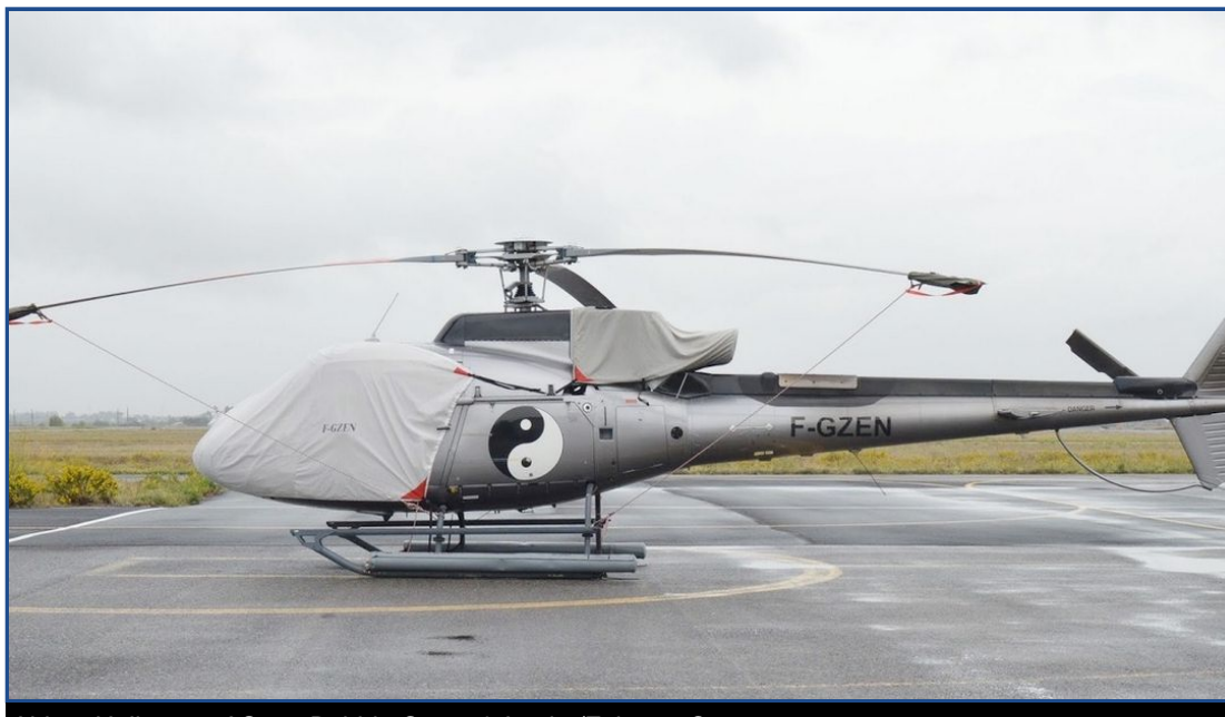
Airbus Helicopter AS350 Bubble Cover &amp; Intake/Exhaust Cover