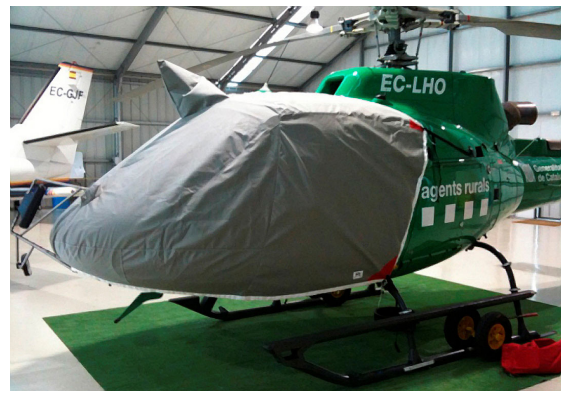
AS350 Bubble Cover with Wire Strike and Cargo Mirror