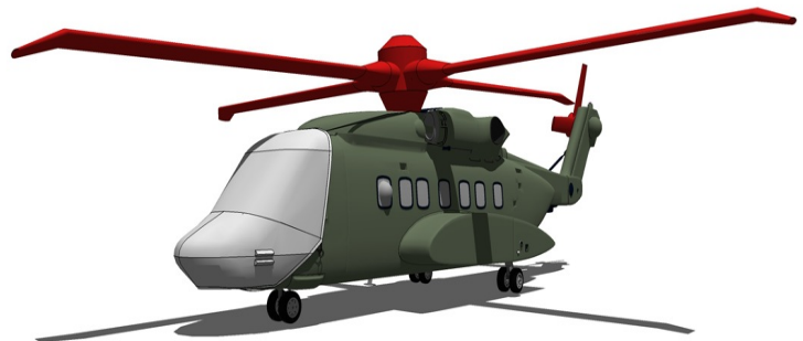
Sikorsky S-92 Windshield/Nose, Blade, Rotor Hub & Tail Rotor Covers