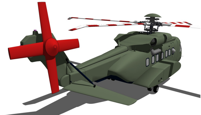
Sikorsky S-92 Tail Rotor Blade and Hub Covers