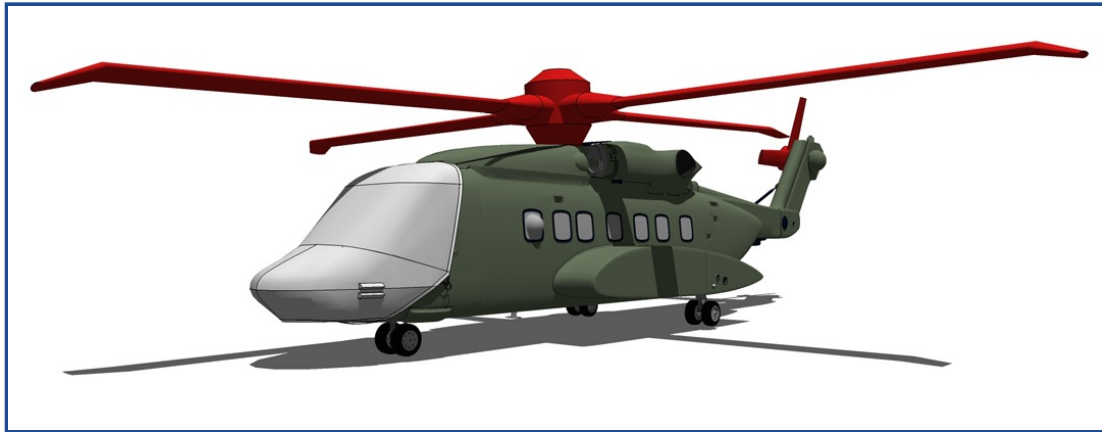
Sikorsky S-92 Windshield/Nose, Blade, Rotor Hub & Tail Rotor Covers