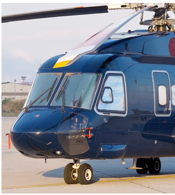
Sikorsky S-92 Cockpit HeatShields