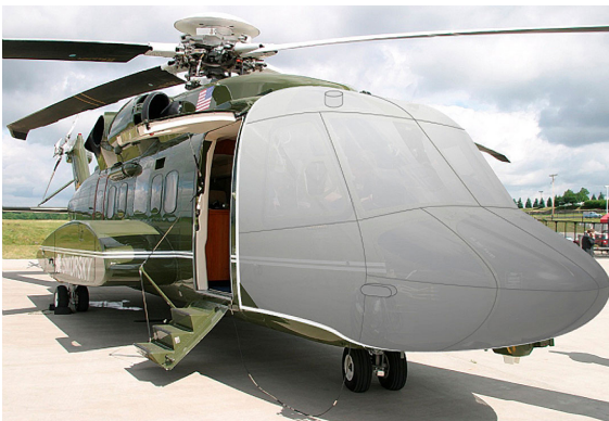
Sikorsky S-92 Windshield/Nose Cover (illustration)

This cover type is made from Silver Acrylic Sunbrella canvas and is 100% lined with a soft and smooth microfiber. Bruce's Custom Covers developed this material combination especially for aircraft protection. The outer material is medium weight and treated for water resistance, UV resistance and anti-static buildup. The inner lining is a very soft and smooth microfiber to prevent scratching. The material is very reflective, and tests show that the cabin interior temperature can be reduced to near-ambient temperature on the hottest of days. It is water, ice and snow repellent, yet breathable to allow moisture to escape from between the cover and the aircraft surface.