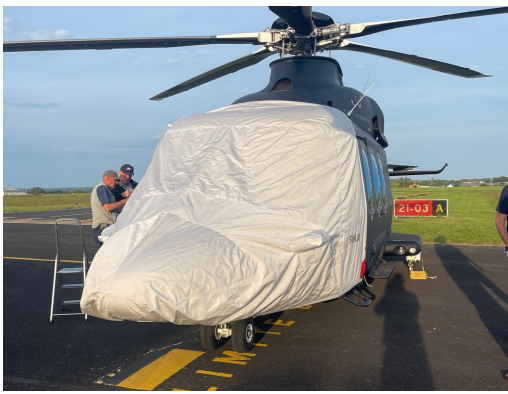
Agusta AW139 Cockpit/Nose Cover