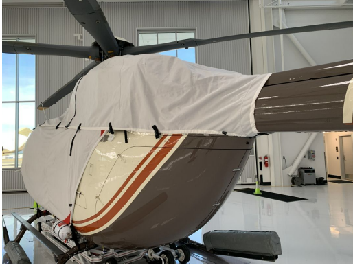
Eurocopter 145 Engine Area Cover, Bubble Cover

This cover type is made from Silver Acrylic Sunbrella canvas and is 100% lined with a soft and smooth microfiber. Bruce's Custom Covers developed this material combination especially for aircraft protection. The outer material is medium weight and treated for water resistance, UV resistance and anti-static buildup. The inner lining is a very soft and smooth microfiber to prevent scratching. The material is very reflective, and tests show that the cabin interior temperature can be reduced to near-ambient temperature on the hottest of days. It is water, ice and snow repellent, yet breathable to allow moisture to escape from between the cover and the aircraft surface.