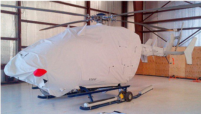
Main Body (also covers bottom), Tailboom, Vertical Pylon, Stabilizers and Tail Rotor Covers