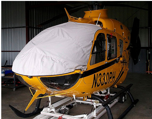
EC-135 Windshield/Skylights Cover, pinches in door jambs

This cover type is made from Silver Acrylic Sunbrella canvas and is 100% lined with a soft and smooth microfiber. Bruce's Custom Covers developed this material combination especially for aircraft protection. The outer material is medium weight and treated for water resistance, UV resistance and anti-static buildup. The inner lining is a very soft and smooth microfiber to prevent scratching. The material is very reflective, and tests show that the cabin interior temperature can be reduced to near-ambient temperature on the hottest of days. It is water, ice and snow repellent, yet breathable to allow moisture to escape from between the cover and the aircraft surface.