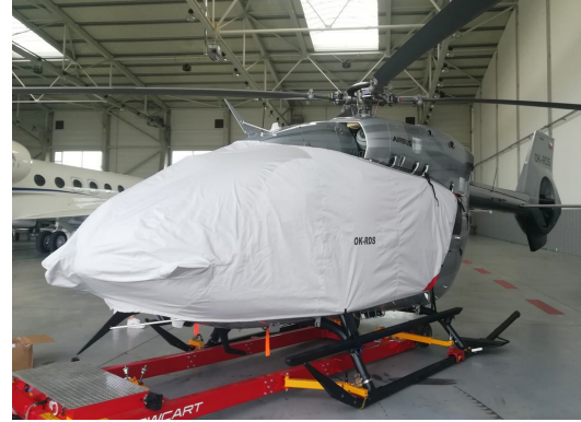
Airbus Helicopter EC-145 Bubble Cover with Radome & Wire Strike