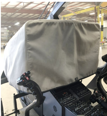
Eurocopter EC-135 Instrument Panel Heatshield Cover

Heatshields are interior sunshades for an aircraft's windows or canopy glass. The product is a unique composite of closed-cell foam with a silver mylar finish. The semi-rigid design is stiff enough to stand along the inside of the windshield using sun visors or window framing. It folds up flat and easily stores in the included storage sleeve. Some designs may require velcro and suction cups. A Heatshield is an excellent short-term remedy for cockpit overheating.