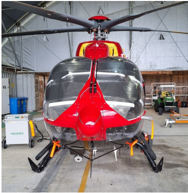
Airbus Helicopter H145D3 Windshield Heatshields, Engine Plugs