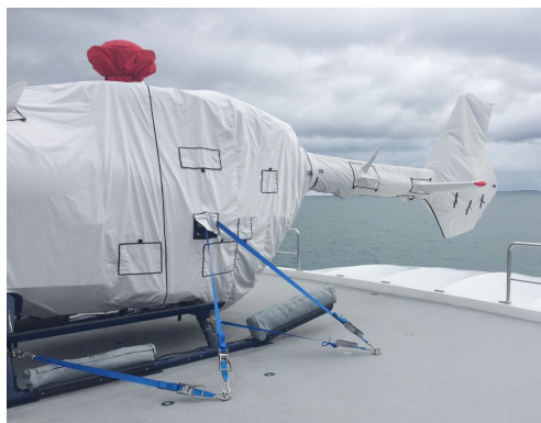
Eurocopter EC-145 D2 Main Body Cover, Tailboom/Fenestron Cover

The Tailboom Cover details vary by model, but generally the helicopter tail boom cover encloses the tail boom from the "bottleneck" to the aft end. They usually also cover the horizontal stabilizers, and are custom made to allow for antennae, lights, and other protrusions. They attach with straps underneath the tail boom. Covers for the vertical and horizontal stabilizers are also available separately. Specific information for each model is available on request.