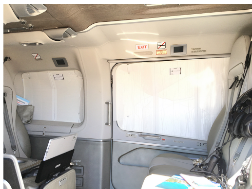
Eurocopter EC-145 Cabin Heatshields

Heatshields are interior sunshades for an aircraft's windows or canopy glass. The product is a unique composite of closed-cell foam with a silver mylar finish. The semi-rigid design is stiff enough to stand along the inside of the windshield using sun visors or window framing. It folds up flat and easily stores in the included storage sleeve. Some designs may require velcro and suction cups. A Heatshield is an excellent short-term remedy for cockpit overheating.