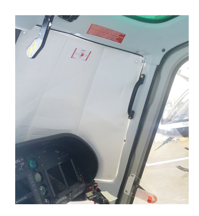
Aerospatiale AS350 Astar, Ecureuil, Esquilo, Fennec Windshield Heatshields

Heatshields are interior sunshades for an aircraft's windows or canopy glass. The product is a unique composite of closed-cell foam with a silver mylar finish. The semi-rigid design is stiff enough to stand along the inside of the windshield using sun visors or window framing. It folds up flat and easily stores in the included storage sleeve. Some designs may require velcro and suction cups. A Heatshield is an excellent short-term remedy for cockpit overheating.