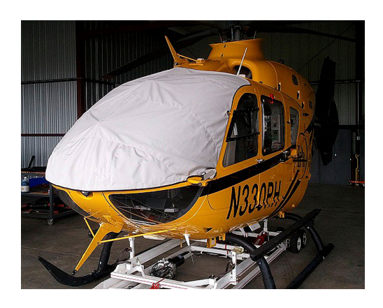
EC-135 Windshield/Skylights Cover, pinches in door jambs

This cover type is made from Silver Acrylic Sunbrella canvas and is 100% lined with a soft and smooth microfiber. Bruce's Custom Covers developed this material combination especially for aircraft protection. The outer material is medium weight and treated for water resistance, UV resistance and anti-static buildup. The inner lining is a very soft and smooth microfiber to prevent scratching. The material is very reflective, and tests show that the cabin interior temperature can be reduced to near-ambient temperature on the hottest of days. It is water, ice and snow repellent, yet breathable to allow moisture to escape from between the cover and the aircraft surface.