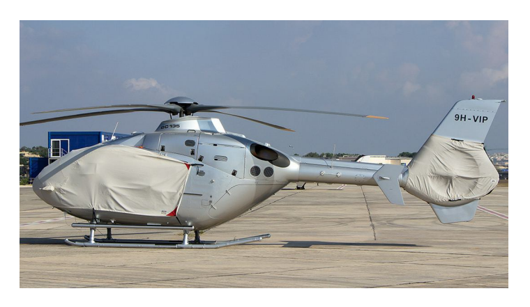
Eurocopter EC-135 Bubble Cover