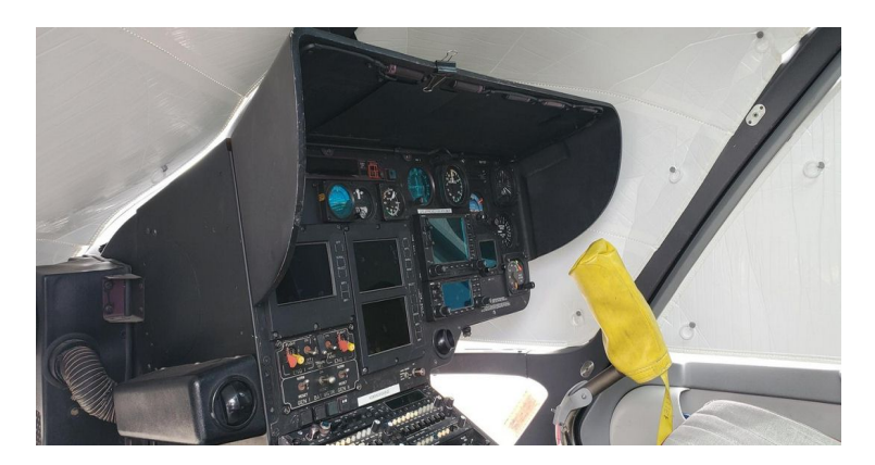
Airbus Helicopter H-135 Cockpit HeatShields