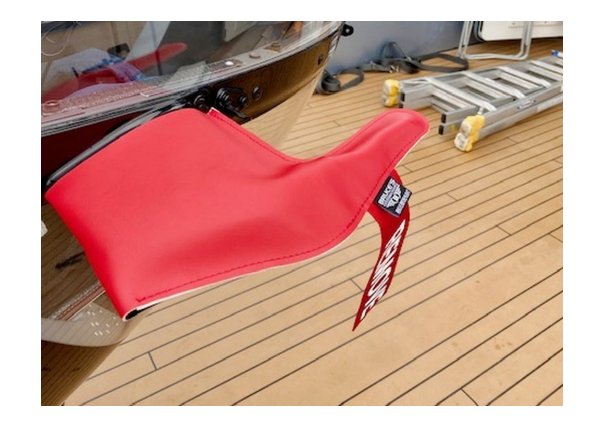
Airbus Helicopter H145 Pitot Tube Cover