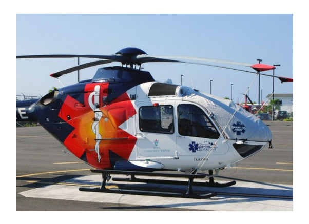
Eurocopter EC-135 Windshield/Skylight Cover