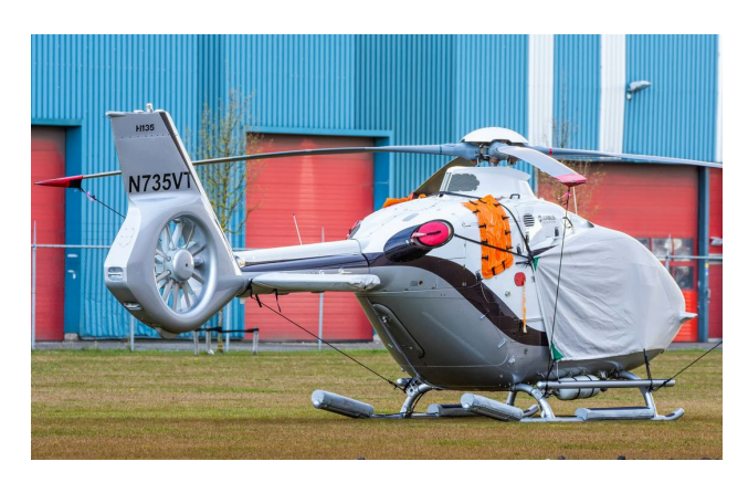
Airbus EC135T3 Blade Tie-Downs