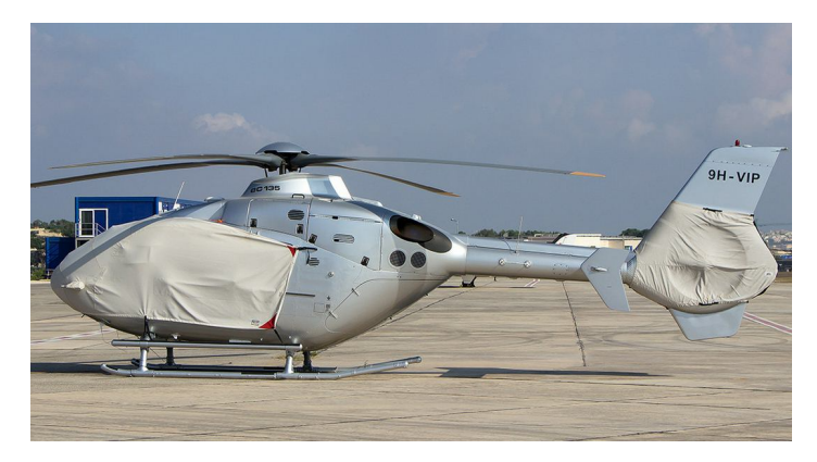
Eurocopter EC-135 Bubble Cover