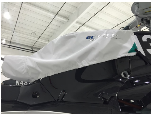
EC-130 Engine Area/Exhaust Cover

The Engine Exhaust Plugs are custom fit for your Airbus Helicopter H-130 exhaust openings, made with heavy-duty vinyl material, and stuffed with a single block of sculpted urethane foam. Exhaust plugs have 'Remove Before Flight' streamers sewn onto the face of the plugs. Exhaust plugs may be inserted soon after flight when the engine is still warm. Engine Inlet Plugs are commonly referred to as Cowl Plugs, Intake Plugs, Cowl Blocks, Engine Blocks, and Engine Bungs.