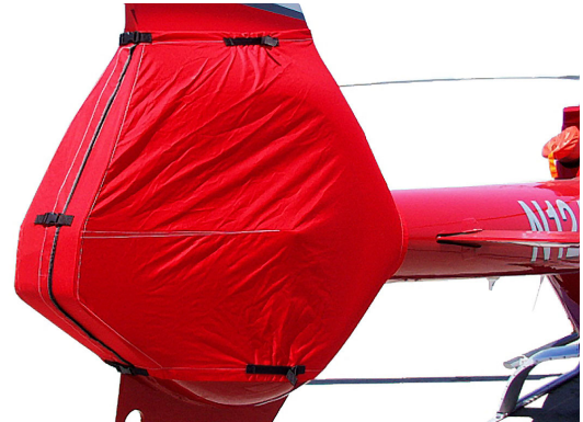
Eurocopter EC-120 Tailfan Cover