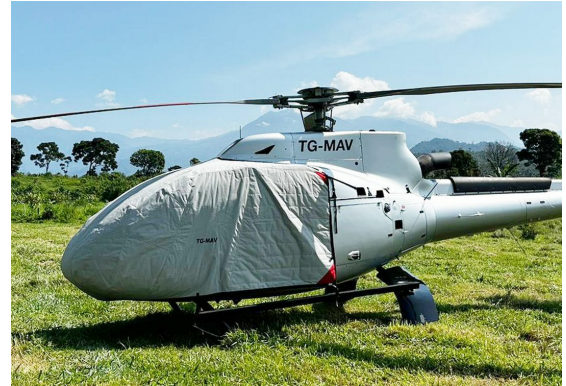
Airbus H-130 Insulated Bubble Cover