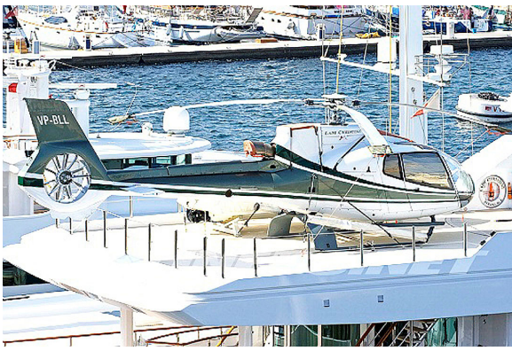
EC-130 Front, Side and Skylight Window HeatShields