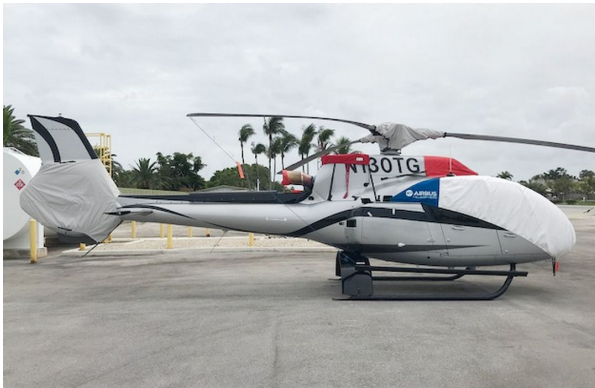
AIRBUS H130 T2, Intake, Exhaust & Tailfan Covers

The Tailboom Cover details vary by model, but generally the helicopter tail boom cover encloses the tail boom from the "bottleneck" to the aft end. They usually also cover the horizontal stabilizers, and are custom made to allow for antennae, lights, and other protrusions. They attach with straps underneath the tail boom. Covers for the vertical and horizontal stabilizers are also available separately. Specific information for each model is available on request.