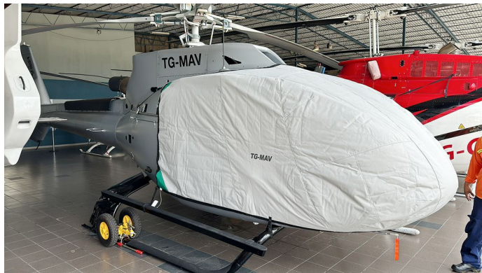
Airbus H-130 Insulated Bubble Cover

This cover type is made from Silver Acrylic Sunbrella canvas and is 100% lined with a soft and smooth microfiber. Bruce's Custom Covers developed this material combination especially for aircraft protection. The outer material is medium weight and treated for water resistance, UV resistance and anti-static buildup. The inner lining is a very soft and smooth microfiber to prevent scratching. The material is very reflective, and tests show that the cabin interior temperature can be reduced to near-ambient temperature on the hottest of days. It is water, ice and snow repellent, yet breathable to allow moisture to escape from between the cover and the aircraft surface.