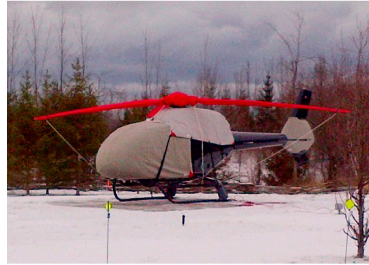
EC-130 Bubble, Engine, Rotor Hub, Blade & Tailfan Covers