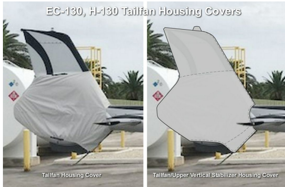
Airbus Helicopter H-130 Tailfan Housing Covers

The Tailboom Cover details vary by model, but generally the helicopter tail boom cover encloses the tail boom from the "bottleneck" to the aft end. They usually also cover the horizontal stabilizers, and are custom made to allow for antennae, lights, and other protrusions. They attach with straps underneath the tail boom. Covers for the vertical and horizontal stabilizers are also available separately. Specific information for each model is available on request.