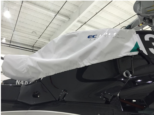
EC-130 Engine Area/Exhaust Cover