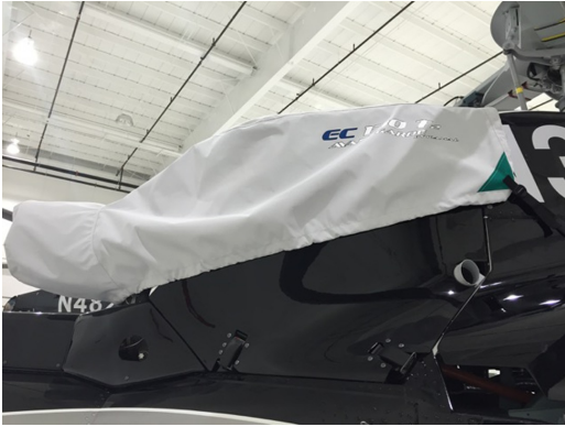
EC-130 Engine Area/Exhaust Cover

some air circulation and drainage in freezing weather. Some part numbers have features for an extra charge.