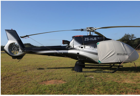
EC-130 Bubble Cover