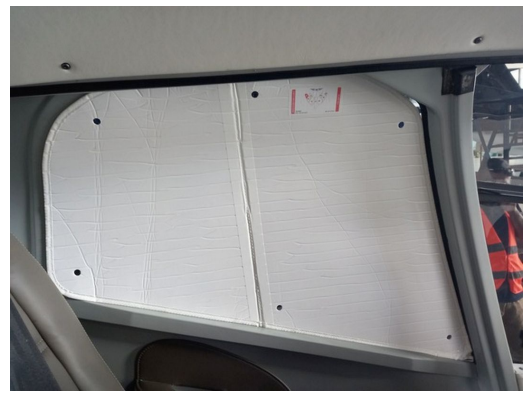
Airbus Helicopter EC130 B4 Side Window Heatshields