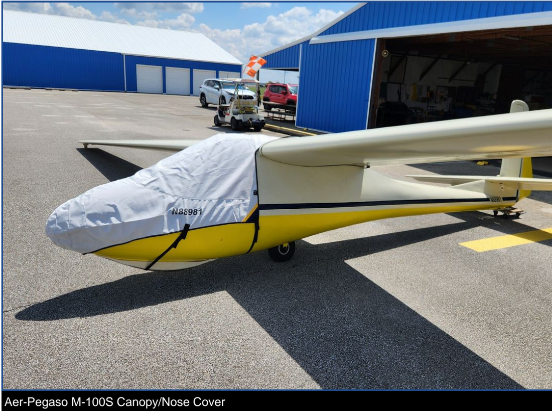
Aer-Pegaso M-100S Canopy/Nose Cover