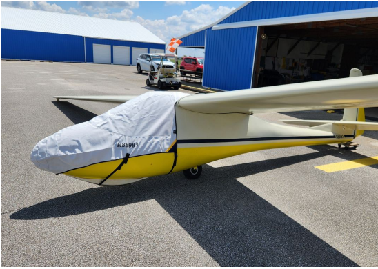
Aer-Pegaso M-100S Canopy/Nose Cover

the hottest of days. It is water, ice and snow repellent, yet breathable to allow moisture to escape from between the cover and the aircraft surface.