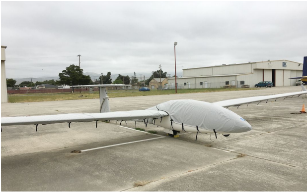
DG-505 Canopy/Nose, Wing, Empennage & Horiz. Stab. Covers

the hottest of days. It is water, ice and snow repellent, yet breathable to allow moisture to escape from between the cover and the aircraft surface.