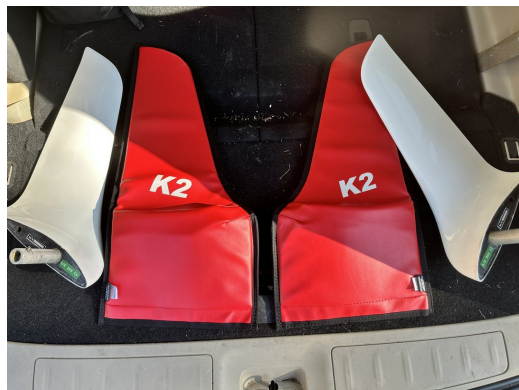
Discus CS Wingtip Pads (Set of 2)

Designed to prevent damage to the aircraft extremities in crowded hangars, these products are made of bright red Naugahyde and thickly padded with a sandwich of closed cell foam. Nowadays they are also made using bright red Neoprene padded laminated (think: wetsuit material).