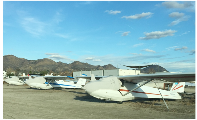
Schweizer SGS 2-33 Canopy/Nose Covers