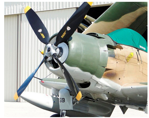
Douglas Skyraider Canopy Cover