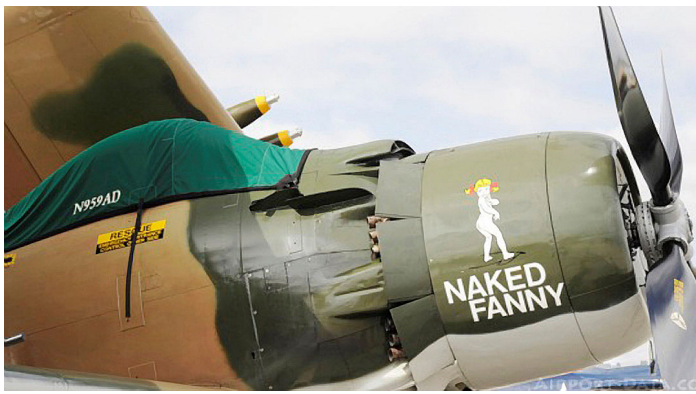
Douglas Skyraider Canopy Cover