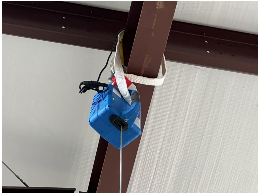
Stearman PT-13 Full Body Dust Cover, Remote Control Winch