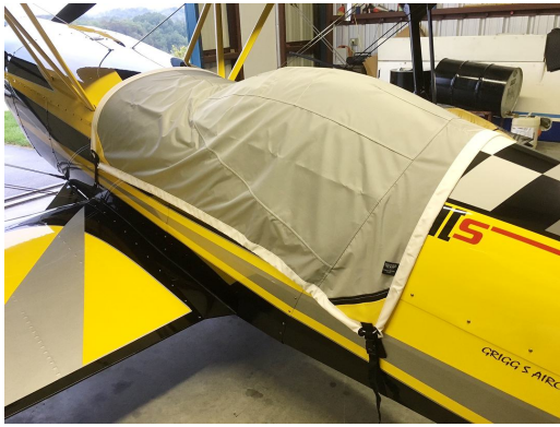
Acro Sport Acro II, Acroduster Travel Cover, Light Weight Travel Canopy Cover