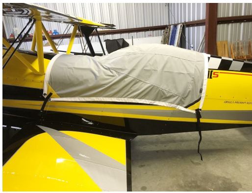
Acro Sport Acro II, Acroduster Travel Cover, Light Weight Travel Canopy Cover