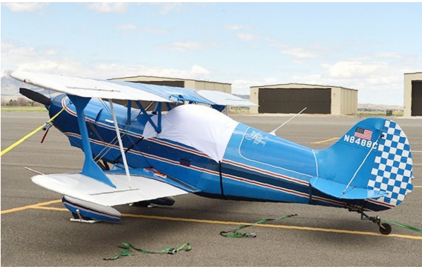
Acro Sport Canopy Cover