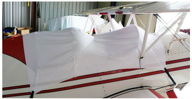
Acro Sport 2 Canopy Cover, test fit cover