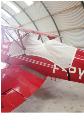
Starduster Too Canopy Cover