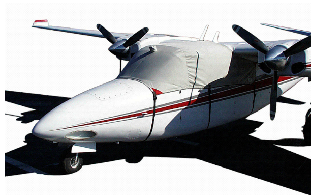
Aero Commander 680 Canopy Cover