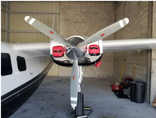
Aero Commander 500-A Engine Plug Set

Engine Inlet Plugs are custom fit for your Rockwell Commander 500, 520, 560, Short 680 intakes, made with heavy-duty vinyl material, and stuffed with a single block of sculpted urethane foam. Each plug has a zipper that allows the foam to be removed and dried if necessary. Engine plugs have warning flags that are visible from the cockpit or 'remove before flight' streamers sewn onto the face of the plugs. Most plugs are imprinted with the aircraft registration number in black for an extra charge. Storage bag NOT included. Engine plugs may be inserted after flight when the engine is still warm. Engine Inlet Plugs are commonly referred to as Cowl Plugs, Intake Plugs, Cowl Blocks, Engine Blocks, and Engine Bunges.