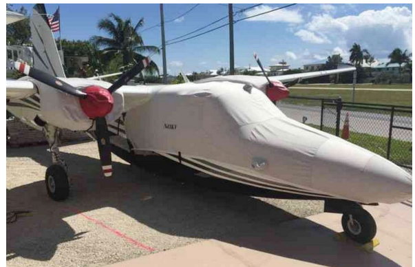
Twin Commander 560F Canopy/Nose & Engine Covers