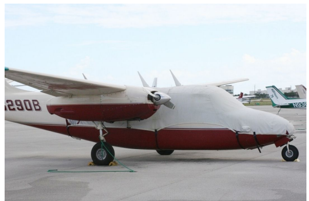
Aero Commander 500 Canopy/Nose Cover Over The Type