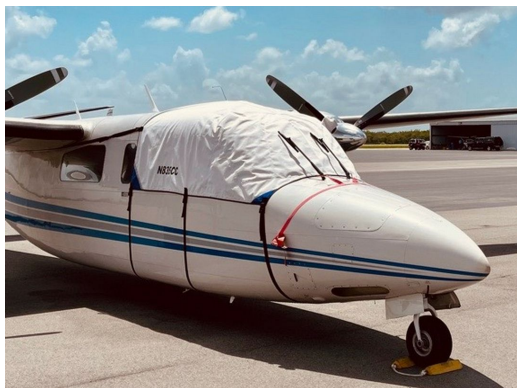
Aero Commander 690C Cockpit Cover

This cover type is made from Silver Acrylic Sunbrella canvas and is 100% lined with a soft and smooth microfiber. Bruce's Custom Covers developed this material combination especially for aircraft protection. The outer material is medium weight and treated for water resistance, UV resistance and anti-static buildup. The inner lining is a very soft and smooth microfiber to prevent scratching. The material is very reflective, and tests show that the cabin interior temperature can be reduced to near-ambient temperature on the hottest of days. It is water, ice and snow repellent, yet breathable to allow moisture to escape from between the cover and the aircraft surface.