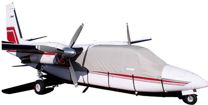
Aero Commander 690b Canopy Cover

Travel Covers are made with Silver Solution-Dyed Polyester fabric and only lined over the windshield to save weight. The material is lightweight and more compact for easy stowage in the aircraft. The polyester material is water resistant, but only intended for occasional use outside. We also have an ultra lightweight material available for fitted hangar dust covers. For daily outdoor use, the non-travel Sunbrella Cover is the best choice.