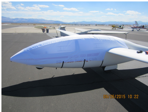
DG-505 Canopy/Nose Cover (test fit cover)