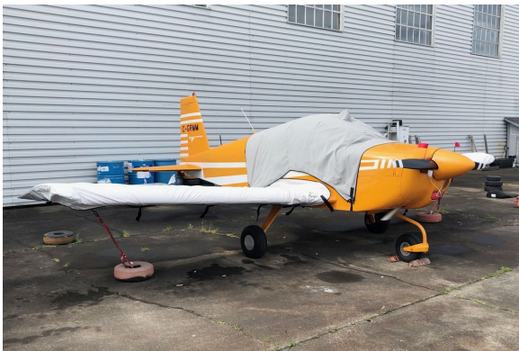
Grumman AA1B Yankee Wing Covers & Engine Inlet Plugs