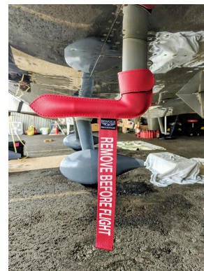
Van's RV-14 Pitot Cover