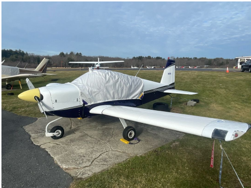
Grumman AA-1A Canopy Cover

This cover type is made from Silver Acrylic Sunbrella canvas and is 100% lined with a soft and smooth microfiber. Bruce's Custom Covers developed this material combination especially for aircraft protection. The outer material is medium weight and treated for water resistance, UV resistance and anti-static buildup. The inner lining is a very soft and smooth microfiber to prevent scratching. The material is very reflective, and tests show that the cabin interior temperature can be reduced to near-ambient temperature on the hottest of days. It is water, ice and snow repellent, yet breathable to allow moisture to escape from between the cover and the aircraft surface.