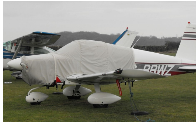
Grumman AA1 Extended Canopy Cover, Engine Cover