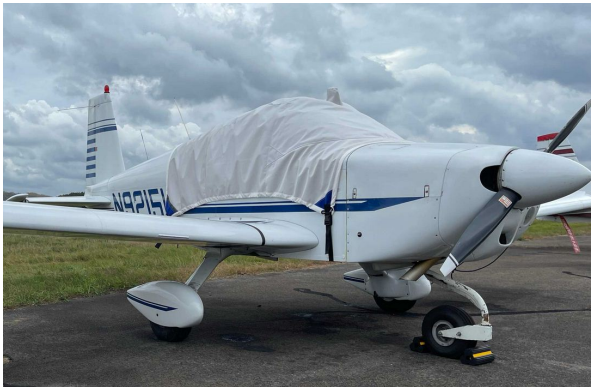
Grumman AA-1A Canopy Cover