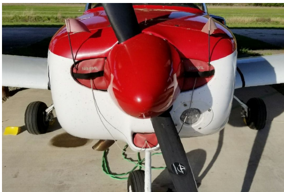
Grumman AA-1 Engine Inlet Plugs

and dried if necessary. Engine plugs have warning flags that are visible from the cockpit or 'remove before flight' streamers sewn onto the face of the plugs. Most plugs are imprinted with the aircraft registration number in black for an extra charge. Storage bag NOT included. Engine plugs may be inserted after flight when the engine is still warm. Engine Inlet Plugs are commonly referred to as Cowl Plugs, Intake Plugs, Cowl Blocks, Engine Blocks, and Engine Bungs.