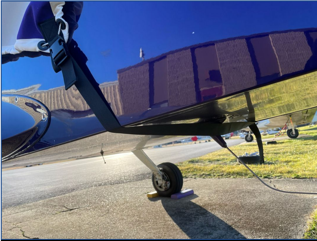
Grumman AA-1A Canopy Cover