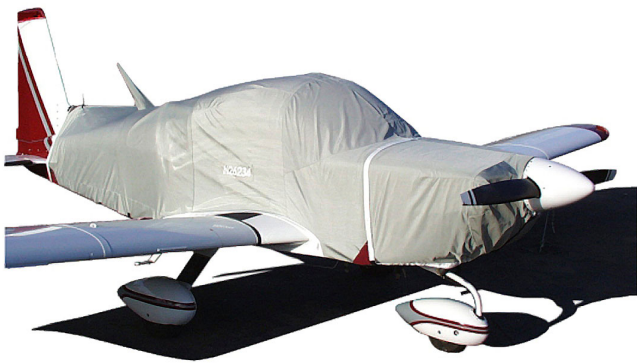
Grumman AA-5 Extended Canopy Cover & Engine Cover

This cover type is made from Silver Acrylic Sunbrella canvas and is 100% lined with a soft and smooth microfiber. Bruce's Custom Covers developed this material combination especially for aircraft protection. The outer material is medium weight and treated for water resistance, UV resistance and anti-static buildup. The inner lining is a very soft and smooth microfiber to prevent scratching. The material is very reflective, and tests show that the cabin interior temperature can be reduced to near-ambient temperature on the hottest of days. It is water, ice and snow repellent, yet breathable to allow moisture to escape from between the cover and the aircraft surface.