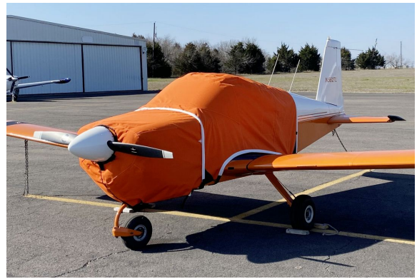
AA-1 Extended Canopy & Fully Enclosed Engine Cover