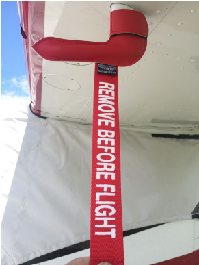
Cessna A185F Pitot Cover