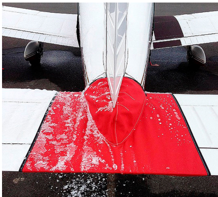
Piper PA-28 Tailcone Cover

WINTER USE MATERIAL - Made with Solution-Dyed Polyester fabric, this option is intended for seasonal use to aid in deicing, rain mitigation, or for occasional travel. The material is lighter and more compact, but more susceptible to UV damage and may have a shorter useful life if used continuously outside than the all-year use material.