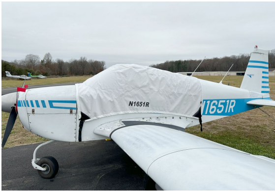
Grumman AA1 Canopy Cover

This cover type is made from Silver Acrylic Sunbrella canvas and is 100% lined with a soft and smooth microfiber. Bruce's Custom Covers developed this material combination especially for aircraft protection. The outer material is medium weight and treated for water resistance, UV resistance and anti-static buildup. The inner lining is a very soft and smooth microfiber to prevent scratching. The material is very reflective, and tests show that the cabin interior temperature can be reduced to near-ambient temperature on the hottest of days. It is water, ice and snow repellent, yet breathable to allow moisture to escape from between the cover and the aircraft surface.