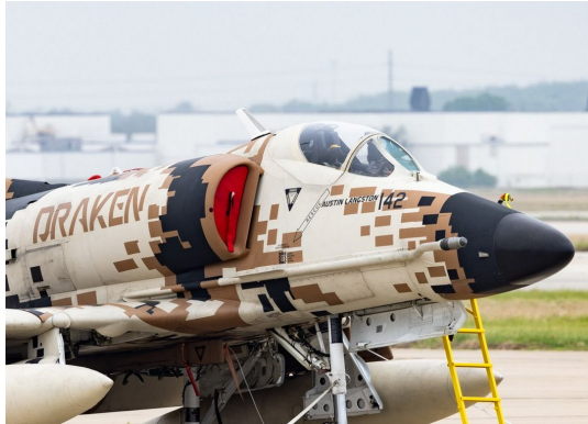
McDonnell Douglas A4 Skyhawk Engine Intake Plugs

The Engine Inlet Plugs are custom fit for your McDonnell Douglas A-4 Skyhawk, single & tandem intakes, made with heavy-duty vinyl material, and stuffed with a single block of sculpted urethane foam. Each plug has a zipper that allows the foam to be removed and dried if necessary. Engine plugs have 'remove before flight' streamers sewn onto the face of the plugs. Most plugs are imprinted with the aircraft registration number in black for an extra charge. Storage bag NOT included. Engine plugs may be inserted after flight when the engine is still warm. Engine Inlet Plugs are commonly referred to as Cowl Plugs, Intake Plugs, Cowl Blocks, Engine Blocks, and Engine Bungs.