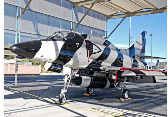
A4 Skyhawk Engine Inlet Plugs