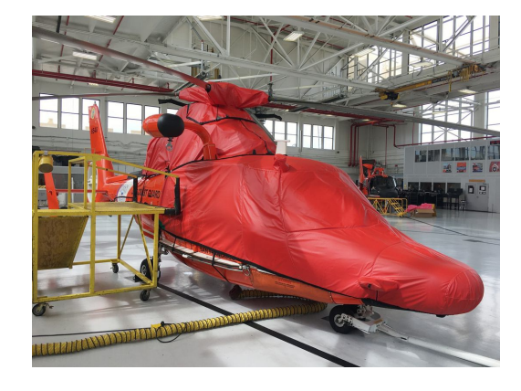
MH-65C Engine Area, Rotor Hub, Swash Plate Aperature Cover set, U.S. Coast Guard HH-65 Dolphin Bubble, Engine & Rotor P/N: A365-210