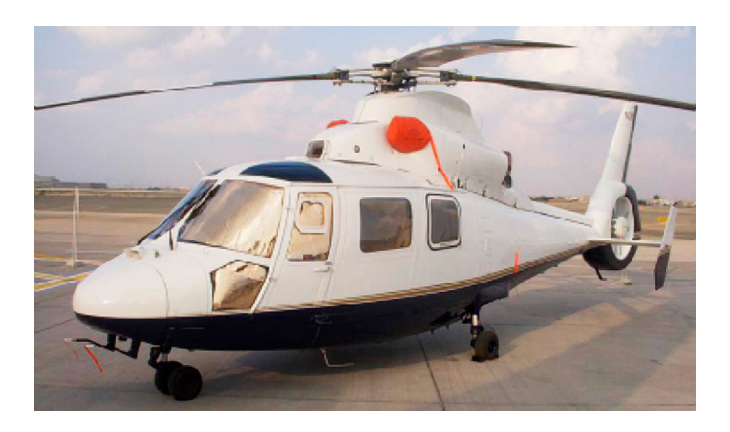
Dauphin HeatShield Set

foam with a silver mylar finish. The semi-rigid design is stiff enough to stand along the inside of the windshield using sun visors or window framing. It folds up flat and easily stores in the included storage sleeve. Some designs may require velcro and suction cups. A Heatshield is an excellent short-term remedy for cockpit overheating.