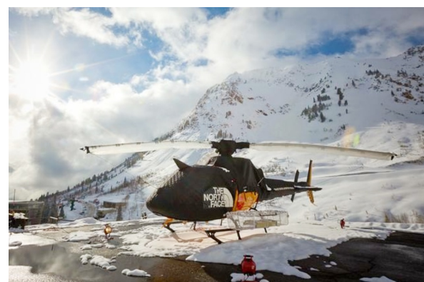
AS350 Insulated Bubble, Engine & Rotor Hub Covers

WINTER USE MATERIAL - Made with Solution-Dyed Polyester fabric, this option is intended for seasonal use to aid in deicing, rain mitigation, or for occasional travel. The material is lighter and more compact, but more susceptible to UV damage and may have a shorter useful life if used continuously outside than the all-year use material.