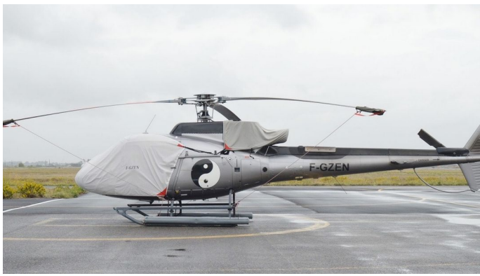
Airbus Helicopter AS350 Bubble Cover & Intake/Exhaust Cover