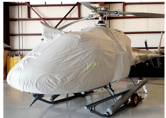
Eurocopter AS350 Main Body Cover