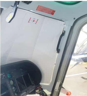
Aerospatiale AS350 Astar, Ecureuil, Esquilo, Fennec Windshield Heatshields