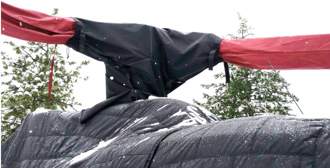
Main Rotor Hub Cover with swash plate extension.

WINTER USE MATERIAL - Made with Solution-Dyed Polyester fabric, this option is intended for seasonal use to aid in deicing, rain mitigation, or for occasional travel. The material is lighter and more compact, but more susceptible to UV damage and may have a shorter useful life if used continuously outside than the all-year use material.