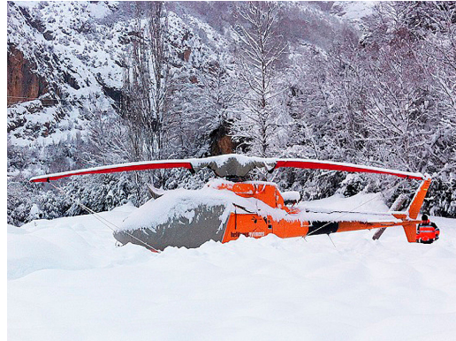
AS350 Bubble Cover, Insulated Main & Tail Rotor Covers, Blade Covers with tie-down detail