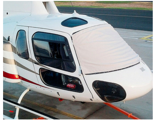
AS350 Windshield Cover, pinches in door jambs