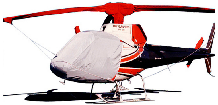
AS350 Bubble Cover with Wire Strike and Cargo Mirror Bubble Cover, Intake/Exhaust, Rotor Mast, Tail Rotor & Main Body Covers