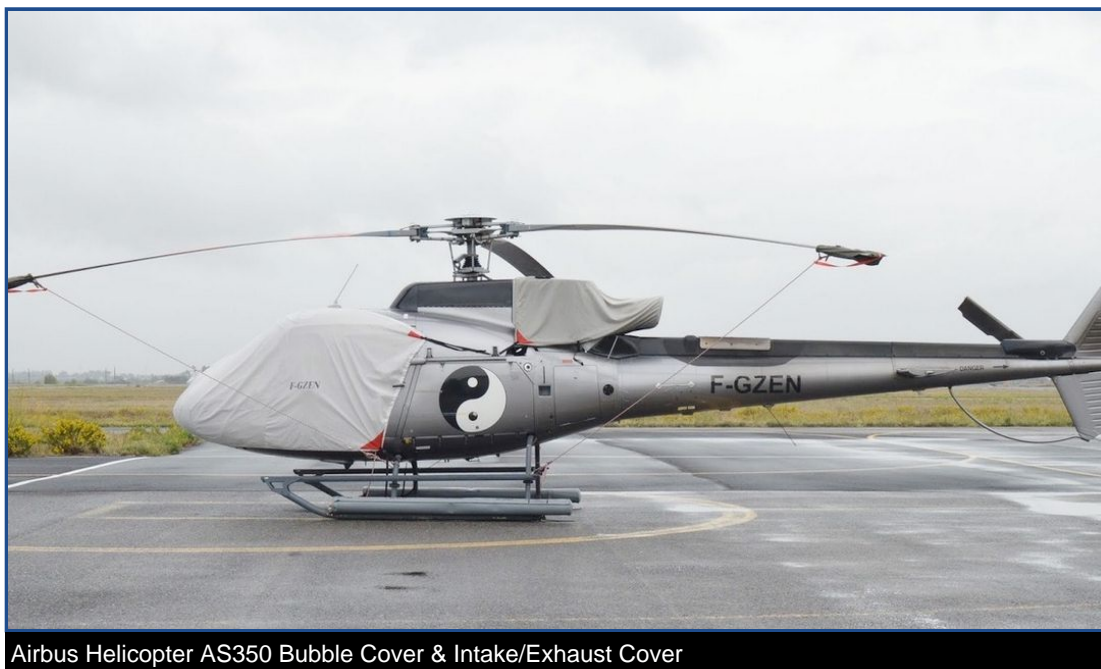
Airbus Helicopter AS350 Bubble Cover &amp; Intake/Exhaust Cover