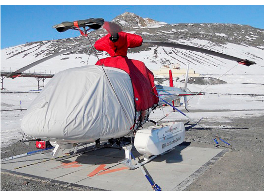
AS350 Bubble Cover w/ Cargo Mirror, Blade Tie-downs, Insulated Engine, Insulated Main Rotor Hub and Insulated Tail Rotor Covers