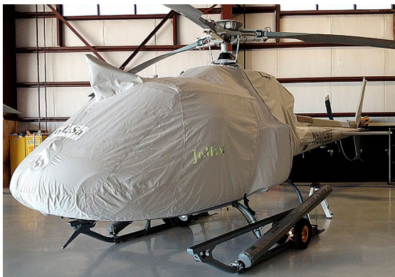
Eurocopter AS350 B3 Main Body Cover, Squirrel Cheeks