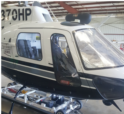
Aerospatiale AS350 Astar, Ecureuil, Esquilo, Fennec Windshield Heatshields

Heatshields are interior sunshades for an aircraft's windows or canopy glass. The product is a unique composite of closed-cell foam with a silver mylar finish. The semi-rigid design is stiff enough to stand along the inside of the windshield using sun visors or window framing. It folds up flat and easily stores in the included storage sleeve. Some designs may require velcro and suction cups. A Heatshield is an excellent short-term remedy for cockpit overheating.