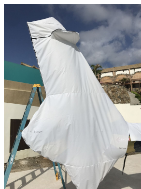
Aerospatiale Gazelle AS341 Tailfan Housing Extended Cover (test fit cover)