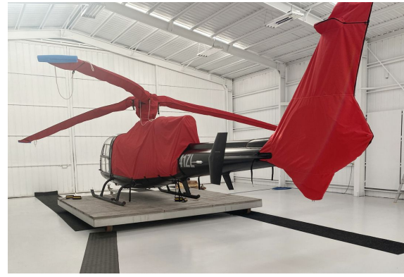
Aerospatiale Gazelle Engine, Rotor Hub, Blades & Tailfan Covers