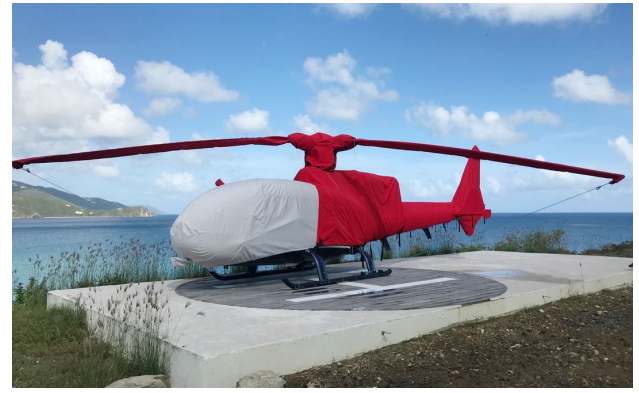
Aerospatiale AS341/342 Gazelle Full Cover Set