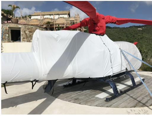
Aerospatiale Gazelle AS341 Bubble, Rotor Mast, Blade, Engine & Tailboom Covers (some are test fit covers)