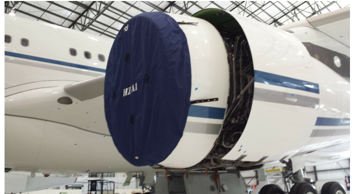
Airbus 340 Intake Covers