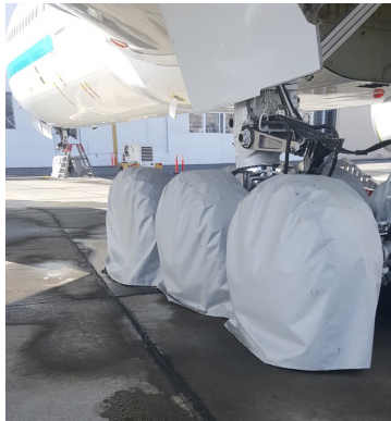
Boeing 777 Main &amp; Nose Gear Tire Covers

ALL-YEAR USE MATERIAL - Made with Silver Acrylic Sunbrella canvas, the all-year use material is the best option for sun protection and cover longevity. This heavier more durable material is intended for all weather conditions, such as rain and snow or lots of sun.