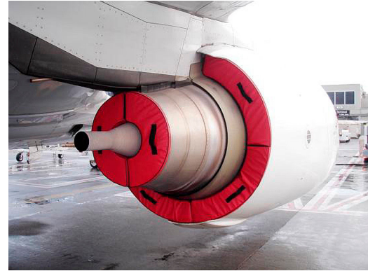
Boeing 737 Bypass and Exhaust Plugs