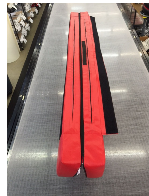
Boeing 737 Max Intake Plug, folding type