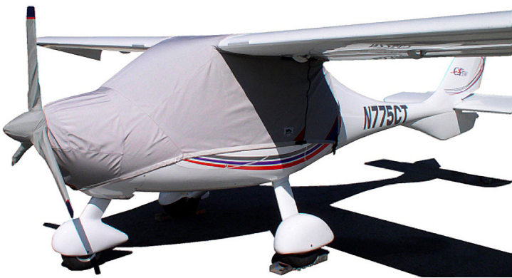
Flight Design CT Canopy/Engine Cover