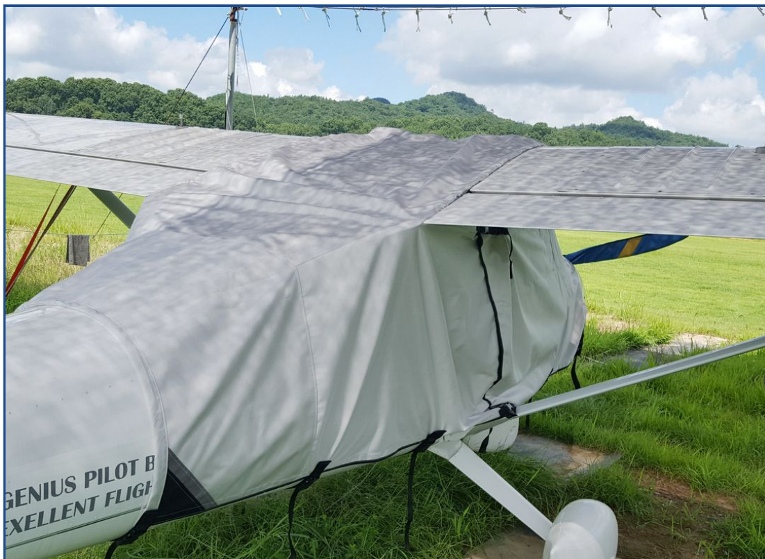
Aeroprakt A-32 Vixxen Canopy Cover, Over-Top Type