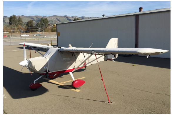
Eurofox Canopy, Engine, Wings and Empennage Covers