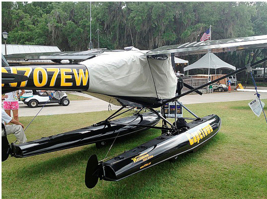
A-22 Over-the-Top Canopy Cover