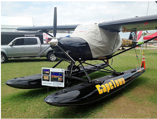
A-22 Over-the-Top Canopy Cover

occasional use outside. We also have an ultra lightweight material available for fitted hangar dust covers. For daily outdoor use, the non-travel Sunbrella Cover is the best choice.