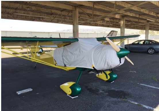
Kitfox Canopy & Engine Covers