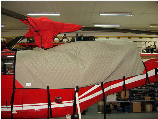
Alouette III Rotor Hub Cover, Insulated Engine/Transmission Cover

WINTER USE MATERIAL - Made with Solution-Dyed Polyester fabric, this option is intended for seasonal use to aid in deicing, rain mitigation, or for occasional travel. The material is lighter and more compact, but more susceptible to UV damage and may have a shorter useful life if used continuously outside than the all-year use material.