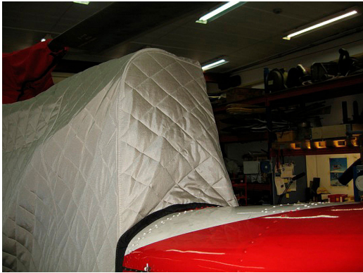
Alouette III Insulated Engine/Transmission Cover