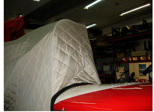
Alouette III Rotor Hub Cover, Insulated Engine/Transmission Cover