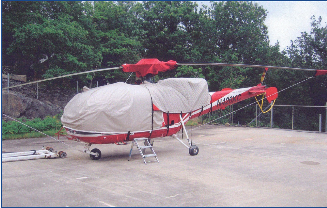
Alouette III Bubble, Rotor Hub &amp; Engine Covers, Blade Tie-Downs