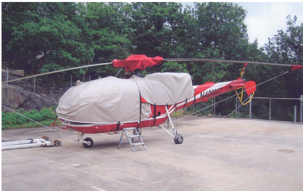
Alouette III Bubble, Rotor Hub & Engine Covers, Blade Tie-Downs