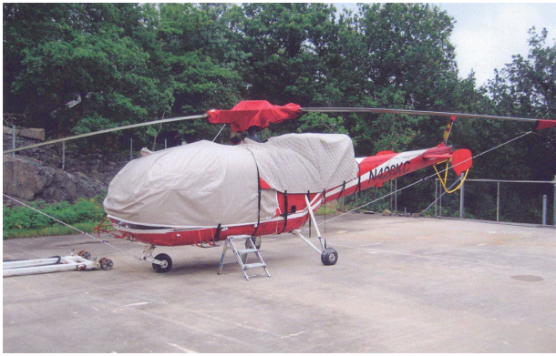
Alouette III Bubble, Rotor Hub & Engine Covers, Blade Tie-Downs