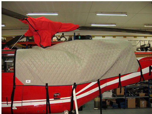
Alouette III Rotor Hub Cover, Insulated Engine/Transmission Cover

WINTER USE MATERIAL - Made with Solution-Dyed Polyester fabric, this option is intended for seasonal use to aid in deicing, rain mitigation, or for occasional travel. The material is lighter and more compact, but more susceptible to UV damage and may have a shorter useful life if used continuously outside than the all-year use material.